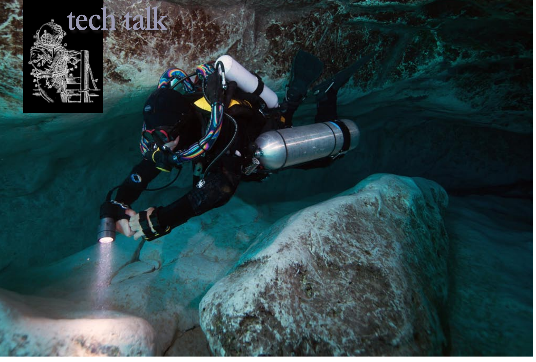
ABOVE The author using his AP rebreather at Jackson Blue Springs, Florida, USA

So far so good. If we are planning a dive to swim into the cave for 40 minutes before we turn, we will need approximately 40 minutes-worth of gas if our unit fails us at maximum penetration. That equals 3200 litres... or a 16 litre cylinder pumped to 200 bar... or one and a half 11 litre tanks filled to 200 bar.