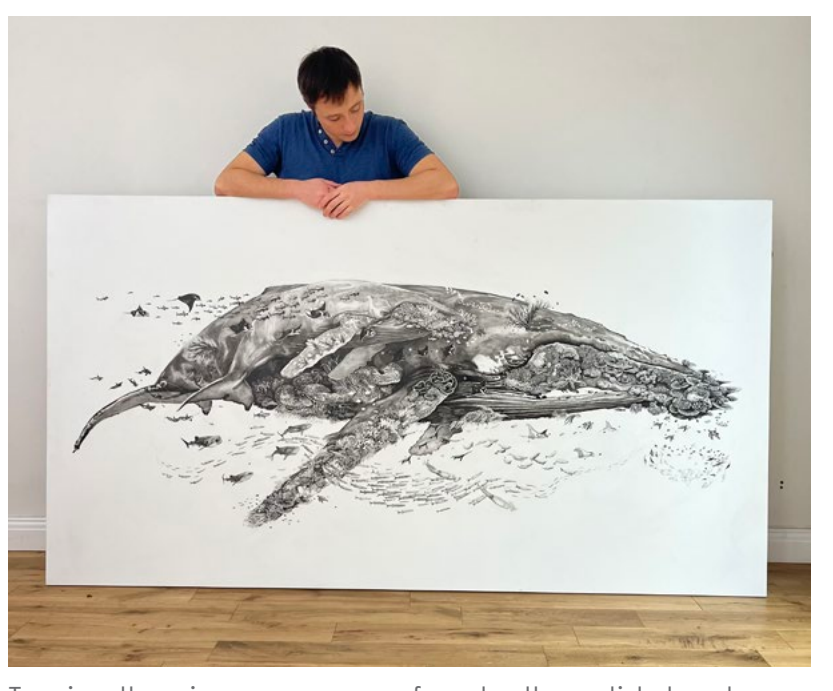
To give the viewer a sense of scale, the artist stands with his original artwork, Whaley McWhaleface.

I work from a home studio in Leicestershire,