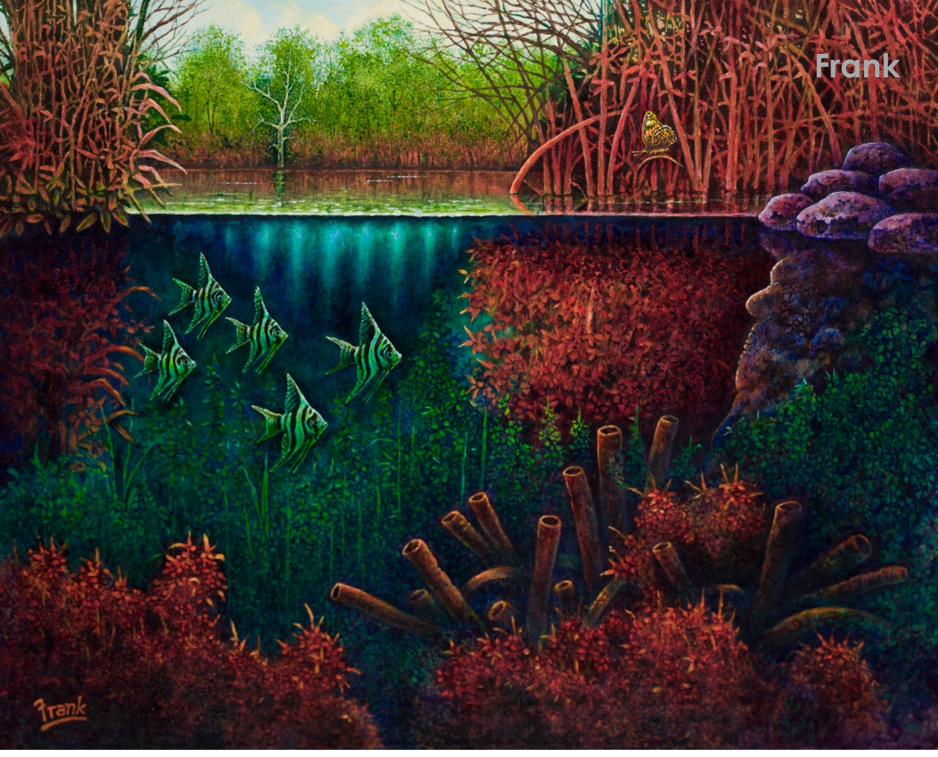
Amazon, by Michael Frank. Acrylic on canvas, 24x30 inches (61x76cm)

fish, underwater plant life and coral formations. I then take these many different pieces and arrange them to my liking. Then I add my own background to come up with my own composition with dynamic lighting for each painting.