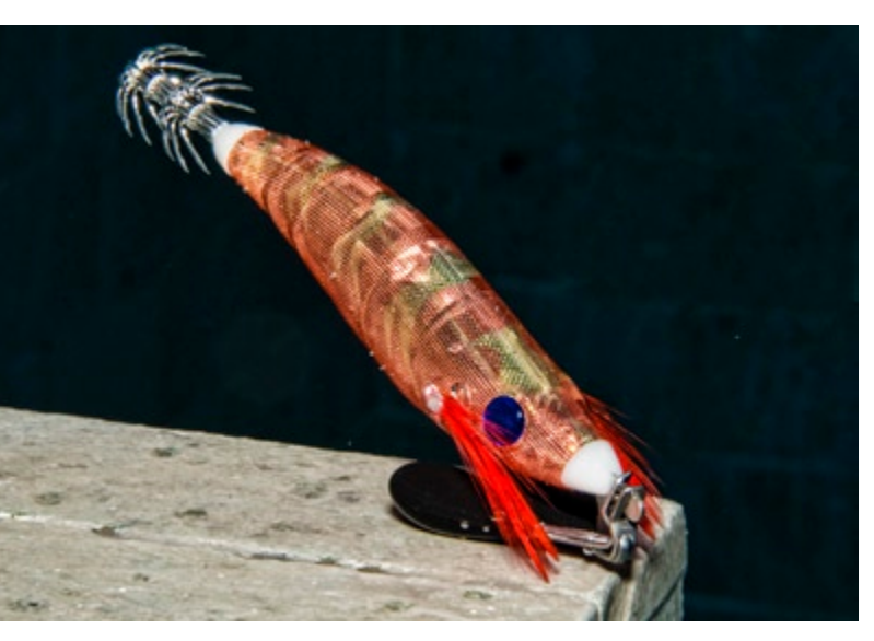
Lure, full frame, Olympus 60

spective and you "shoot upwards" to isolate the main subject as much as possible.