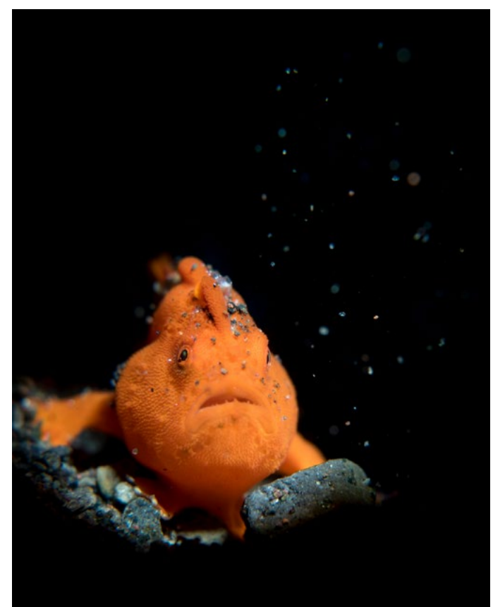
Snowing - Frogfish at Kuwanji, Tulamben, Bali. ISO100, f5.6, 1/250

A close encounter with manta rays in 2000 inspired Lilian Koh of Singapore to take up scuba diving and underwater photography. Also drawn to tiny critters, her macro photography has won top awards.