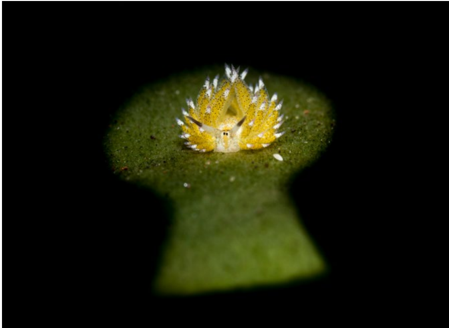
Keyhole - Costasiella kuroshimae, affectionately known as the "Shaun the Sheep" nudibranch, at Malesti, Tulamben, Bali, ISO100, f10, 1/200

My first big trip was to Sipadan where I was armed with a tiny camera with a one-inch display. From then