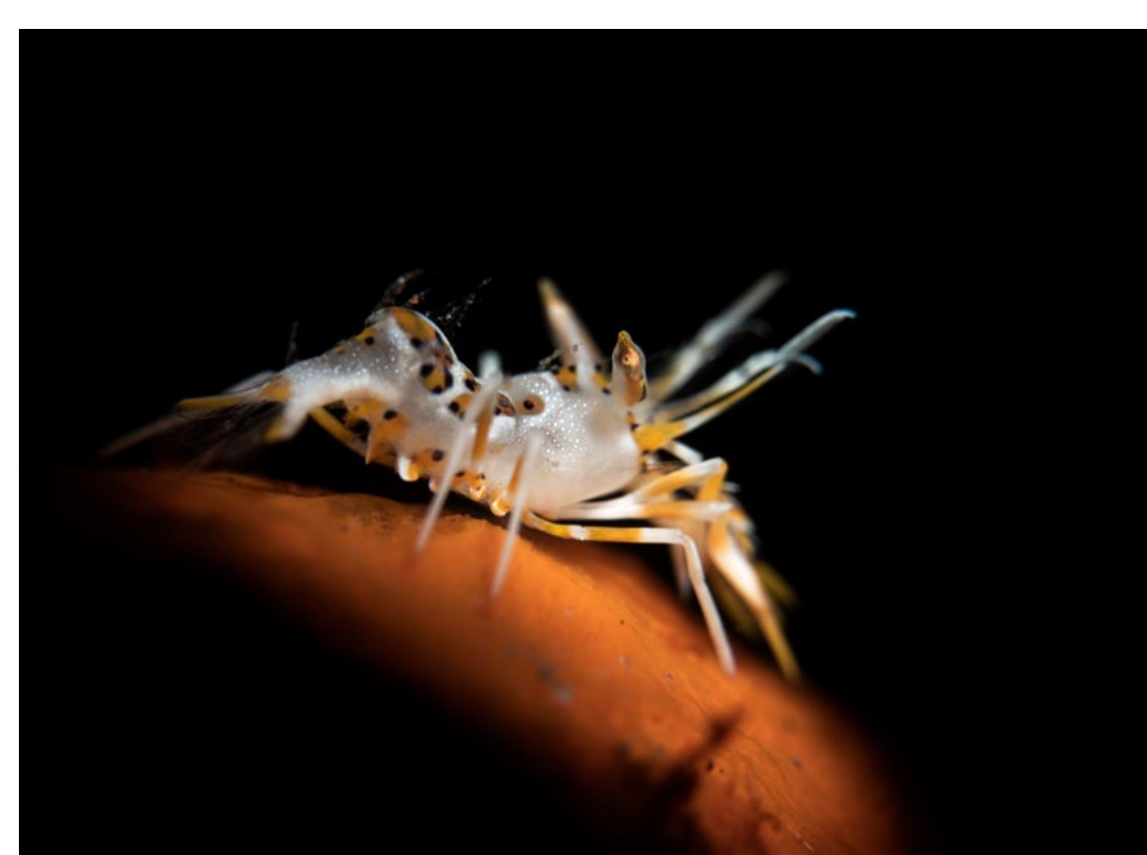
Tiger