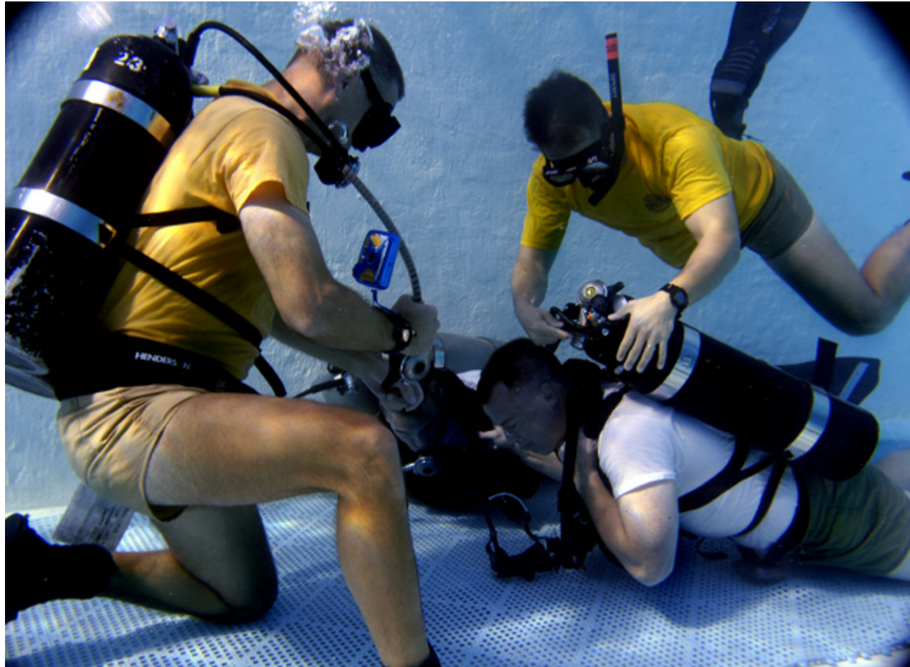
Two instructors at the Naval Diving and Salvage Training Center here test a student's ability to stay calm during a confidence training exercise Wednesday, Dec. 6, 2006. The exercise is designed to better prepare scuba students at the training center for real-world emergencies

Guard—it doesn't matter. Everyone here is an equal and is expected to live up to the same physical fitness standards set forth by the training center.