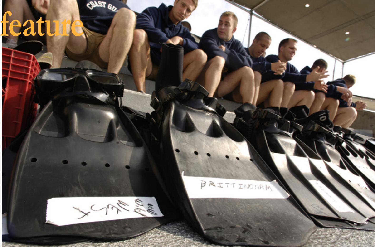
Students at the Naval Diving and Salvage Training Center here gather and wait for a briefing on their next dive exercise. Twenty-five students are enrolled in the training center's scuba course, and if they successfully complete the course, they will re-enter the fleet as military-certified scuba divers