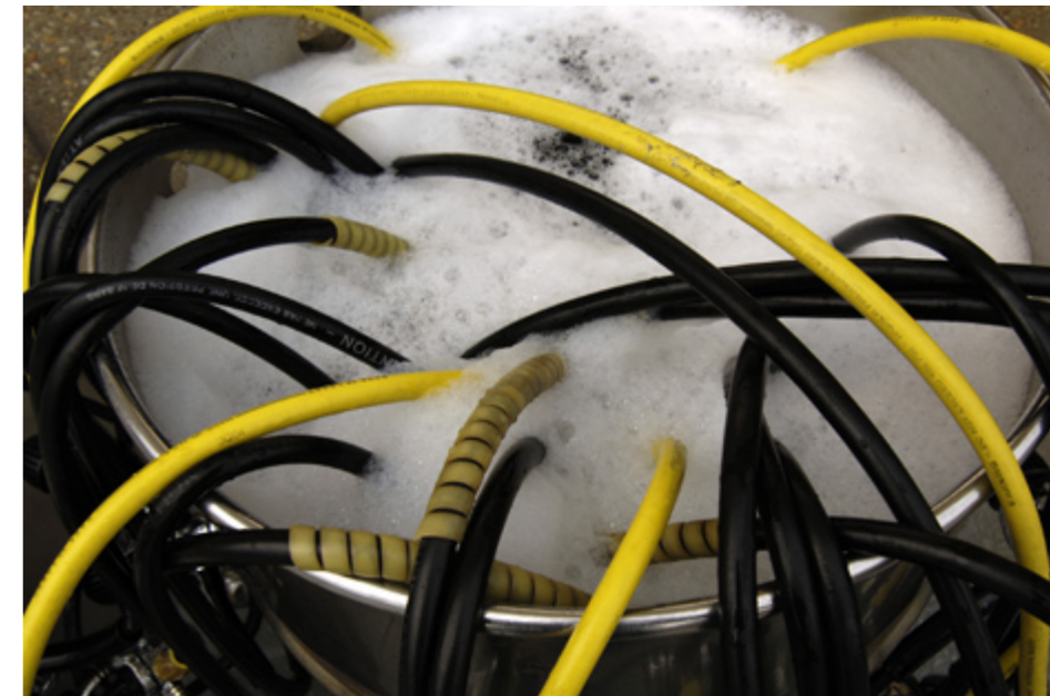
A bath of cleaning solution is used to sterilize scuba regulators used by diving students at the Naval Diving and Salvage Training Center here. The regulators are cleaned after each diving exercise at the center

The training is tough, and everyone is held to the same standard. Enlisted, officer, male, female, Navy, Coast