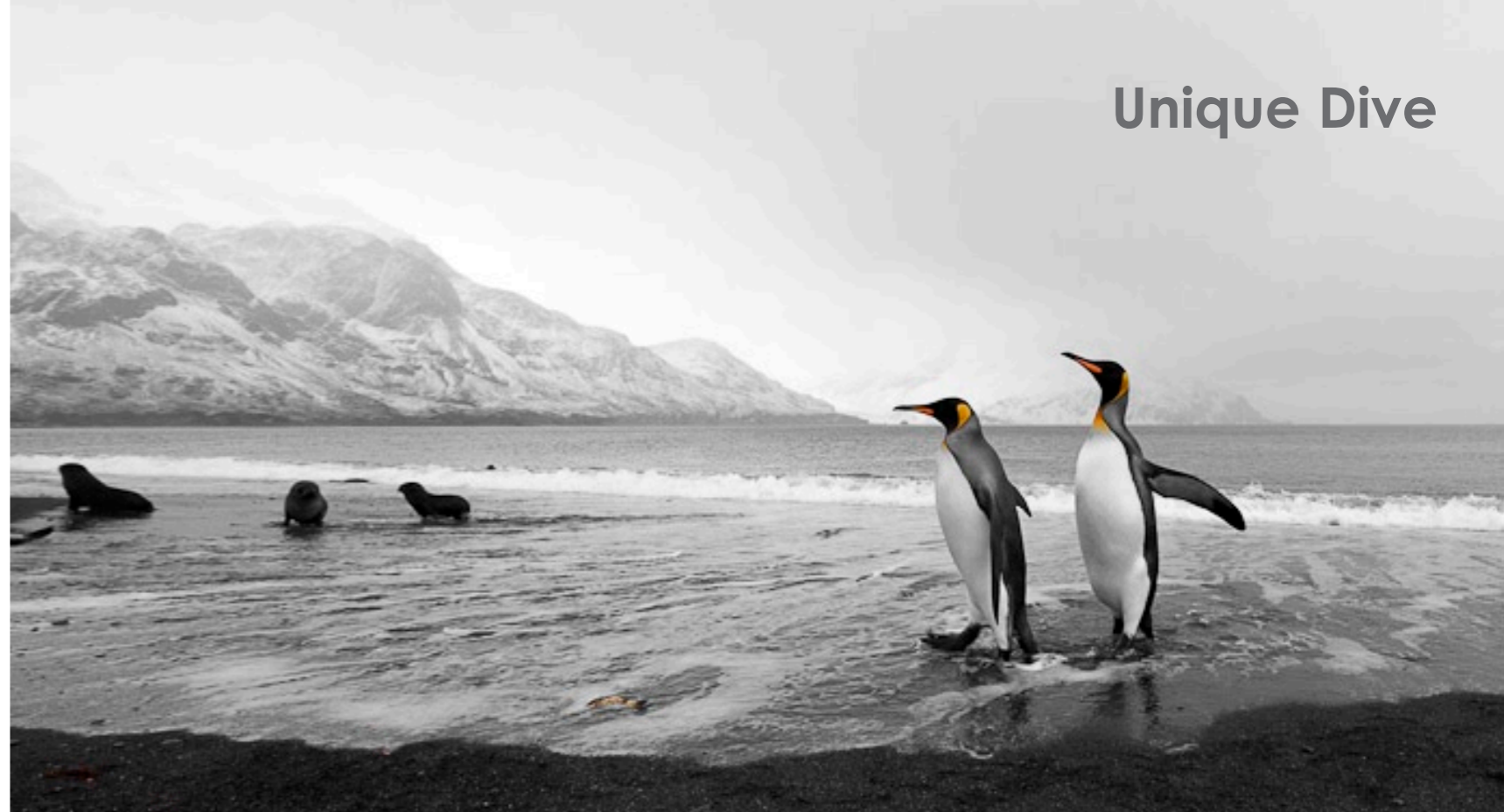
Fur seal (left) defending its rock, very curious and active, moving around all the time; King penguin pair (above) and seals on beach; Female elephant seal (right) swimming in one of the South Georgia bays