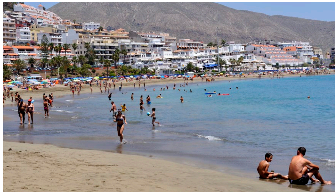
White sandy beach, Las Americas/Los Cristianos