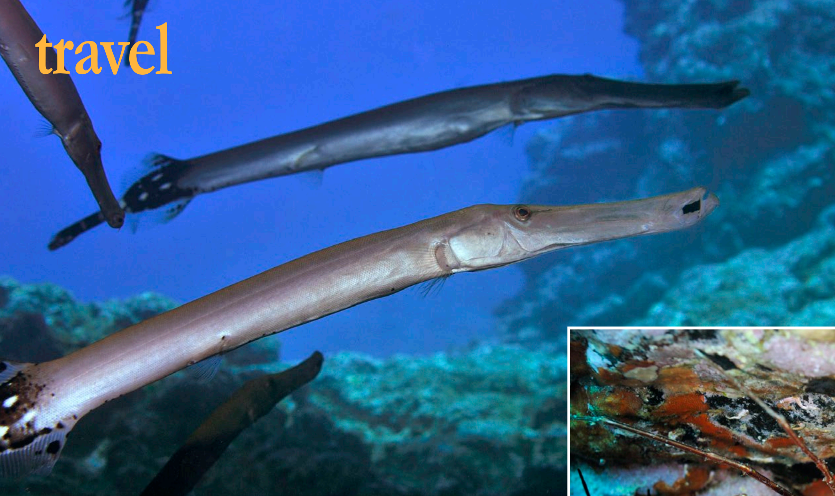
Trumpetfish (left); Arrow crab on rock with red encrusting sponge (below); Diver on reef at Las Americas (right)

reef top, but swimming to the edge at 25m, it dropped nearly vertically into the deep. This was used by some of the club divers to gain depth progression; carrying stage cylinders, they were going through a tunnel at 42m, exiting deeper. The rest stayed shallower, having a slow drift dive, going over rock reefs with sand-bottomed gorges in between, before ending on a shal-