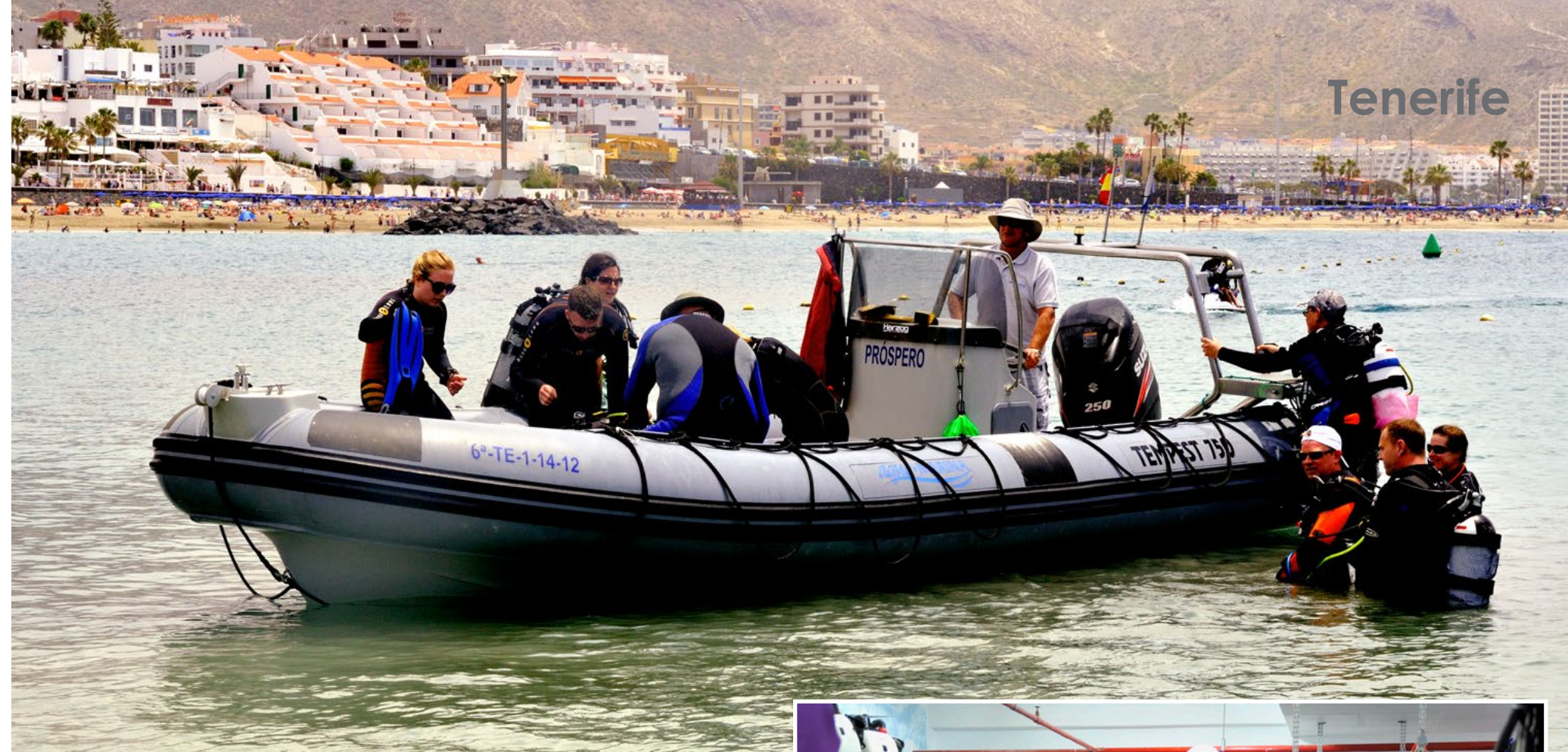
Sand sculpture on beach at Las Americas/Los Cristianos (above); Simple sheltered beach entry for the RIB (right); Aqua-Marina is a well equipped dive shop with good condition hire equipment, space for leaving your own and a pool for testing (lower right and below)

runs about half to a mile offshore, with a few places where it can be reached by a giant shore-based stride entry. Sinking ships seldom end up at sports dive depths, though more are at technical depths.