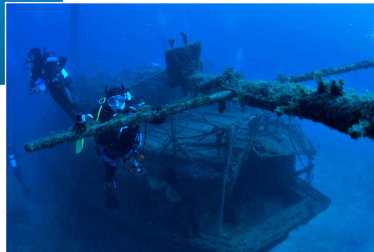
THIS PAGE: Scenes from El Meridian wreck; Diver at propeller and rudder (top right)

So, the strong points about diving in Tenerife are the temperate waters, sheer reliability of getting dives in, plus all the accoutrements of a major holiday destination. The easy and wide range of depths, good