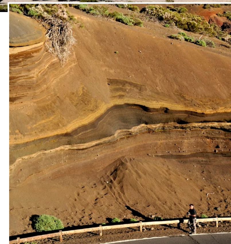
In a roadside cutting, layers of ash are evidence of many millennia of volcanic eruptions on Tenerife

about being in the middle of a tourist area, but it proved fine—not all just candy floss. Yes, it was touristy—much like Sharm El Sheikh—yet offering a vast range of activities, the legacy of the package holiday era updated with what's new.