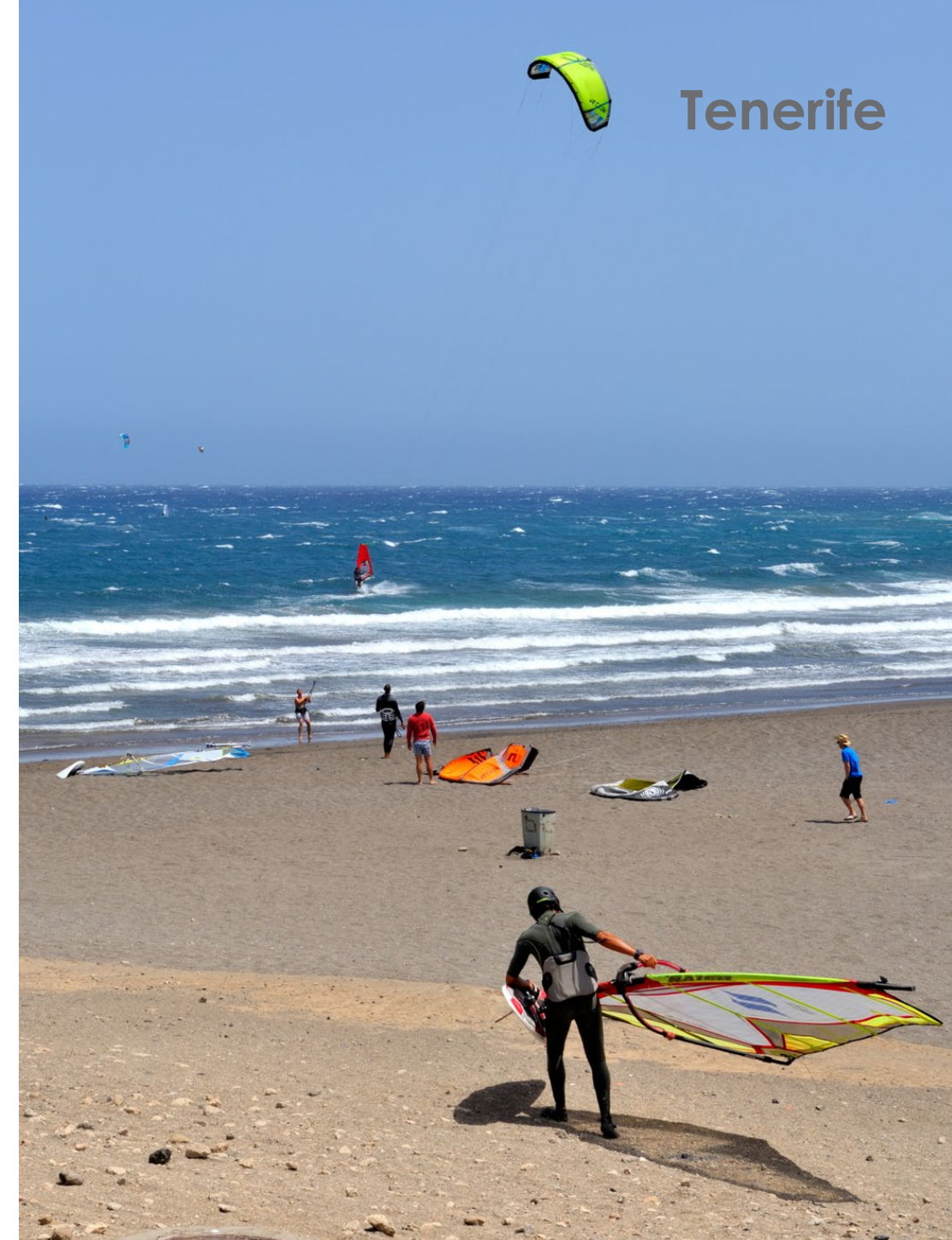
The summit of Teide (above). The national park hosts a variety of plant and animal species, many of them endemic; El Medano or Windy beach (right). Parts of Tenerife are constantly windy while farther down the coast it can be nearly dead calm, the effects of the lee side of Mount Teide