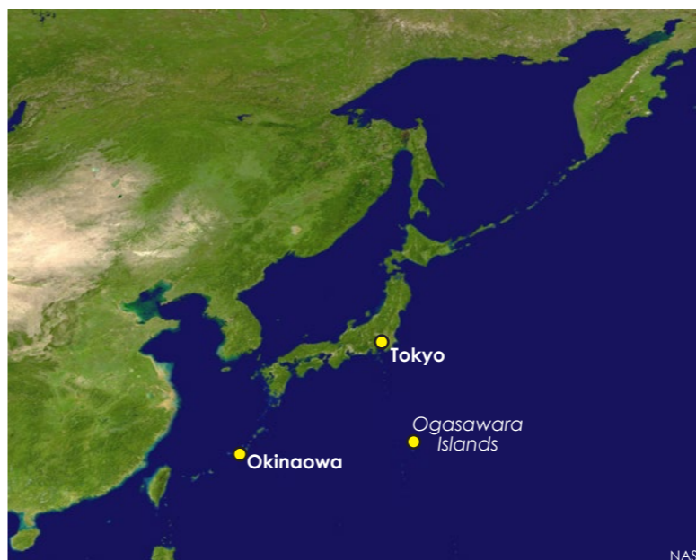
CLOCKWISE: Divers on reef at Chichijima; Guest house cuisine; Restaurant in Chichijima; Location of Ogasawara Islands on satellite map of Japan

The general area around the archipelago was known as the "Japan grounds" during the early 19th century when whaling was at its peak. And because Japan was closed to foreigners at that time, the Ogasawara Islands were used as safe harbours to replenish supplies.