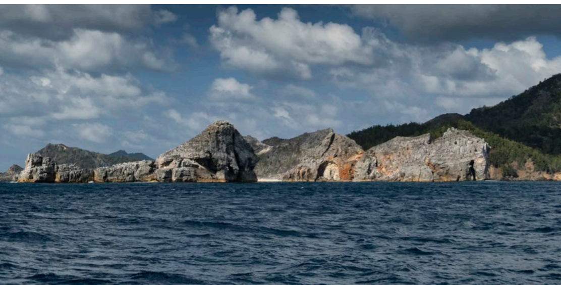
Futami Port (above) on the island of Chichijima (left); The Ogasawaru Maru departs (below)

departs from Takeshiba Pier, in the harbour area close to Tokyo Bay, which means one can use the excellent, if initially mind-boggling, Tokyo rail system to get between the two. Boarding the actual ferry, the Ogawasara Maru , is done with true Japanese courtesy and efficiency, but you quickly realise that foreigners are few and far between on this journey.