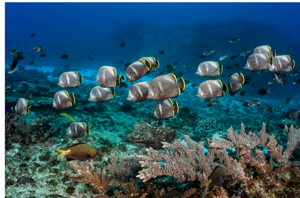
School of wrought-iron butterflyfish, which are native to southern Japan

Overall, the diving around Chichijima is very pleasant, but not spectac-