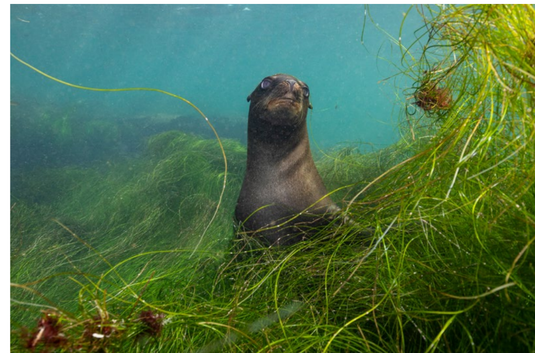
A California sea lion plays hide-and-seek with the photographer in the sea grass.

This first dive would be solo, shallow and relaxing. I wandered back to the car to begin laying out my gear: a 7mm wetsuit, 5mm hooded vest, gloves, booties and, of course, my trusty camera, with wide-angle lens and dome port attached.