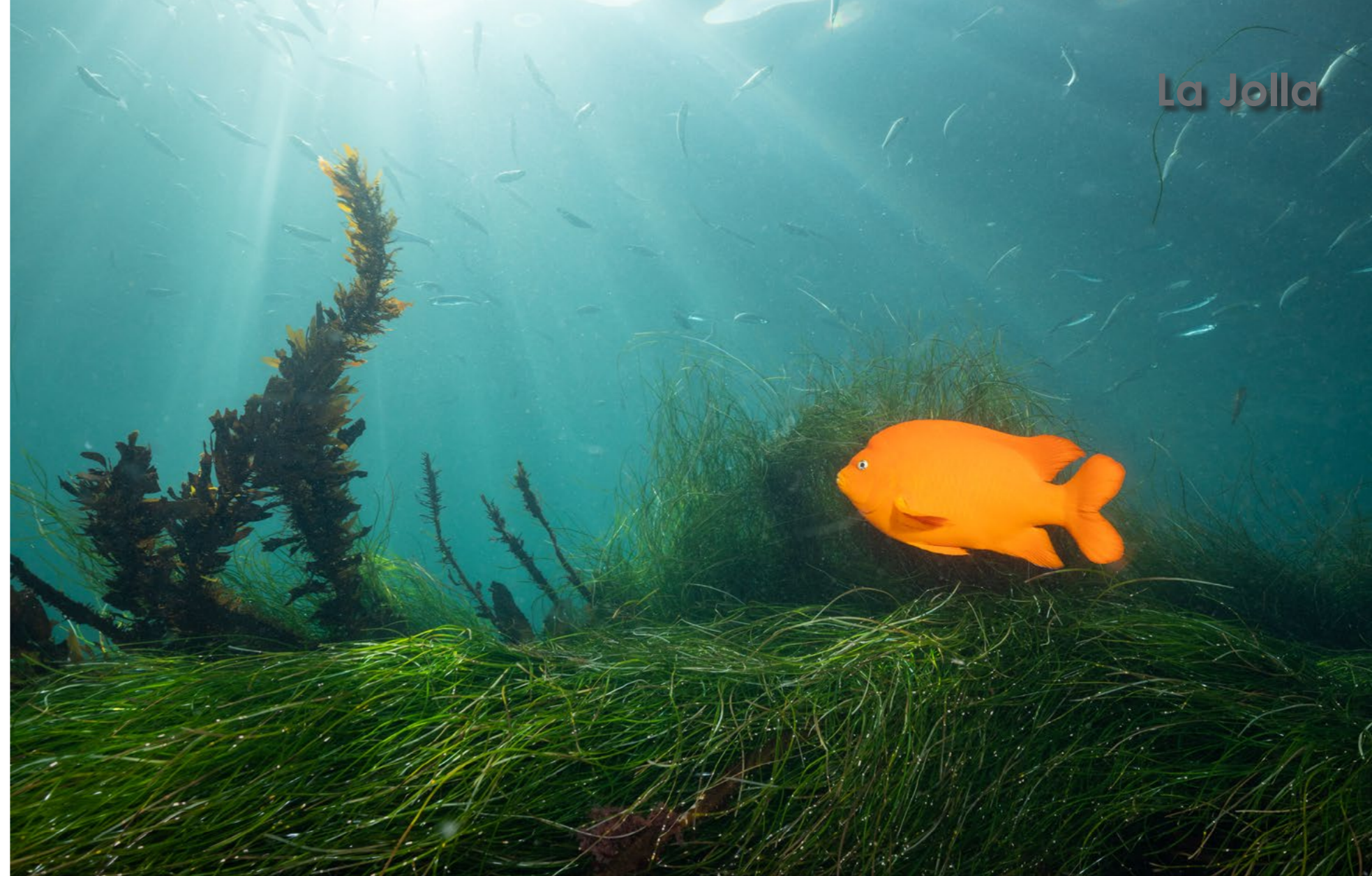
A classic La Jolla underwater scene, complete with Garibaldi fish ( Hypsypops rubicundus ), sea grass and sunrays

Cool sunlight slowly crept down from the horizon to the kelp beds off La Jolla in southern California. I took another sip of coffee. Sea lions barked on occasion as small groups of pelicans flew up the coast to start their day.