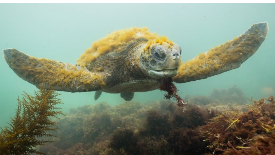
A green sea turtle ( Chelonia mydas ) covered in algae is very comfortable with the camera (top left) and swims over the algae-covered bottom with a piece of red algae still stuck to her mouth (left); A leopard shark ( Triakis semifasciata ) found while snorkeling at La Jolla Shores (top right)

La Jolla Cove, walking into the village to order tacos and relax on the patio of a Mexican food restaurant.