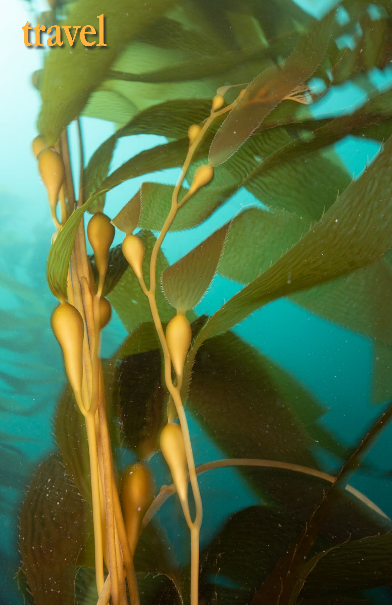
A slow shutter speed helps create a sense of movement in these giant kelp detail photos. PREVIOUS PAGE: California sea lions play in the shallow sea grass of La Jolla Cove.