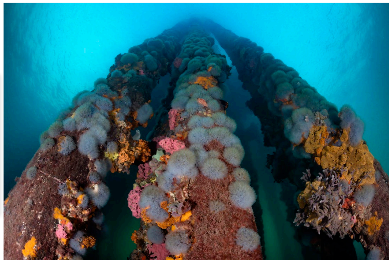
Sponges, tunicates and invertebrates cover the pylons (above, top left and previous page) of Edithburgh Jetty (in aerial view top right); Map showing Australia's ocean currents, gyres and eddies (left)

Yes, I know—first impressions are not always correct, but they do matter