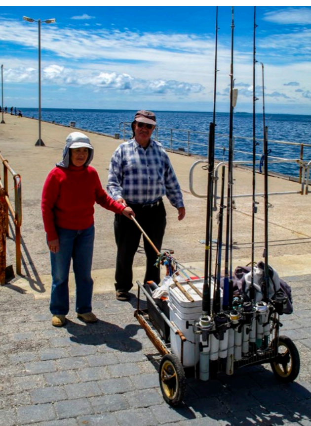
Fisho's, or "people who like to fish," at the jetty