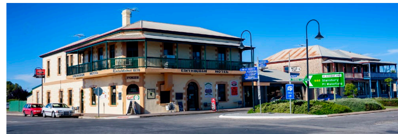
Downtown Edithburgh during rush hour

Getting to know it all over a series of dives is what I really enjoyed about diving Edithburgh. It is such an easy but great dive, where you can spend hours