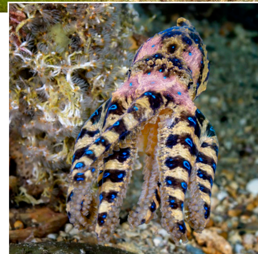
Blue swimmer crab (above); Leafy seadragon under the jetty (top right); Highly venomous blue-ringed octopus (left)

ern sides of the jetty near the parking area. So, once you are geared up, it is a short walk and an easy entrance. Getting out again is the reverse and also straightforward, unless the wind changed while you were underwater.