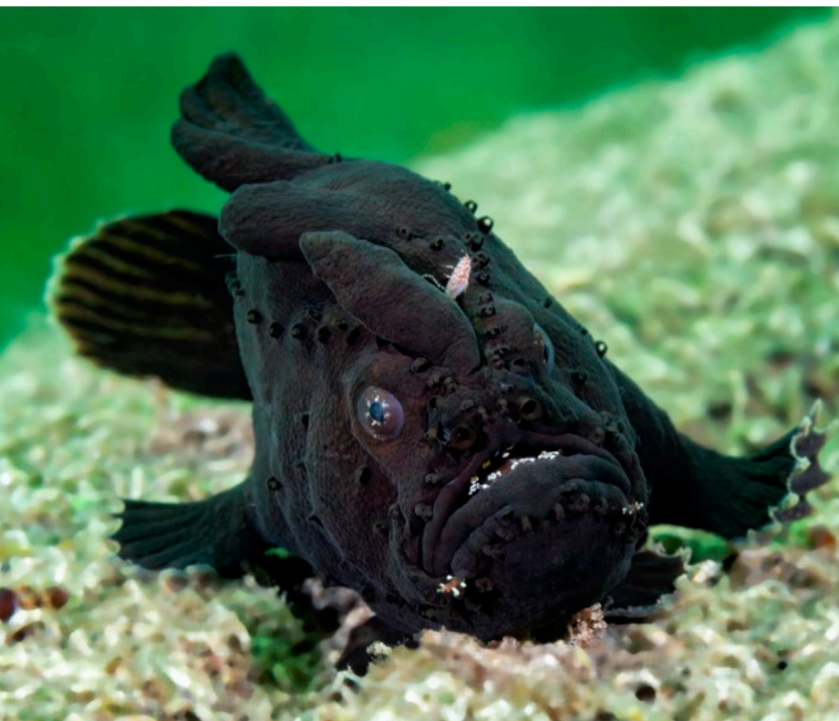
Mating pair of pajama squid (above); Leafy seadragon under the jetty at Edithburgh (left); Black angler frogfish (bottom left); Map sketched by the author, showing where critters like frogfish and seahorses were found around Edithburgh Jetty (right)

ible infrastructure for the temperate water corals, sponges and ascidians to thrive on an almost biblical scale—yes, it's that good!