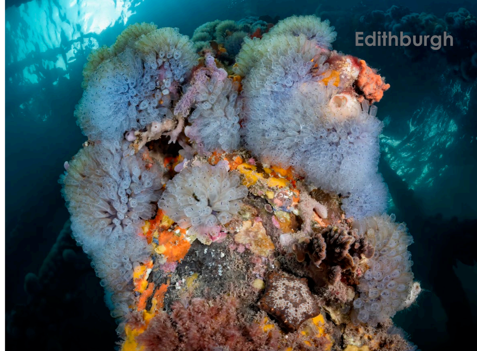
Diver under the jetty (above); Pylon covered with invertebrates (right)