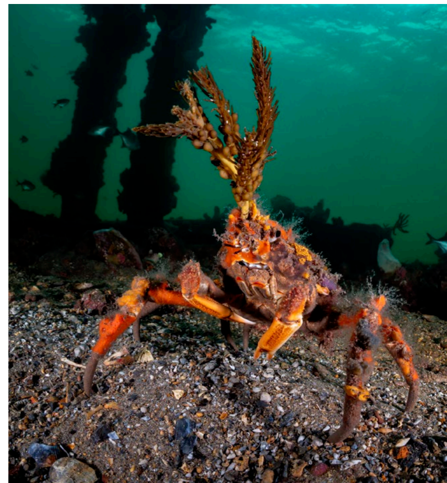
Decorator crab (above); Map of the region with location of Edithburgh and Adelaide (left)

They can't, of course, but what they can do is stand as silent witnesses to the fecundity of those Great Southern Reef currents and the rich upwellings they create. For the wide and low structure of the jetty has created an incred-