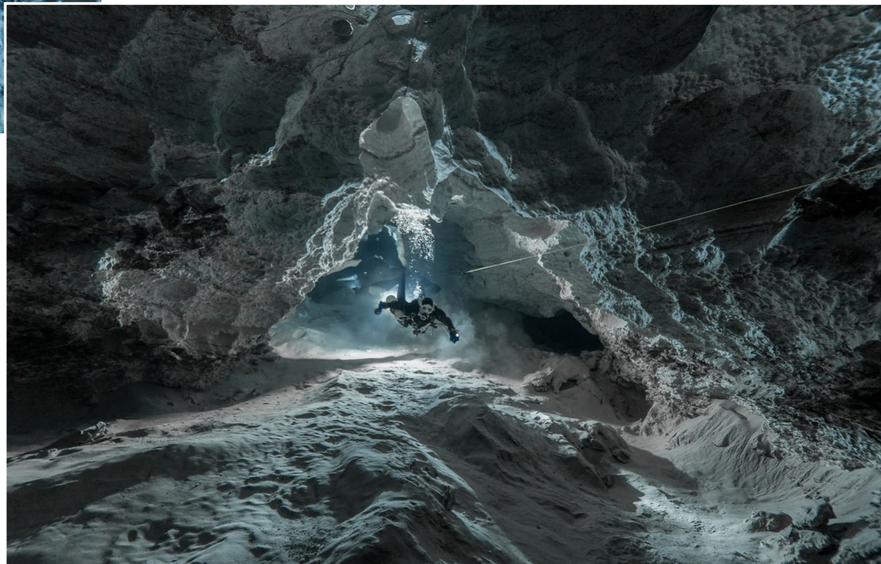
THIS PAGE: Photographs taken as part of the Prometheus Project by the Orda Cave Underwater Speleology Center in Russia

ments have been made, with various ideas and methods of cave diving. Having made hundreds of dives in the cave, we were able to