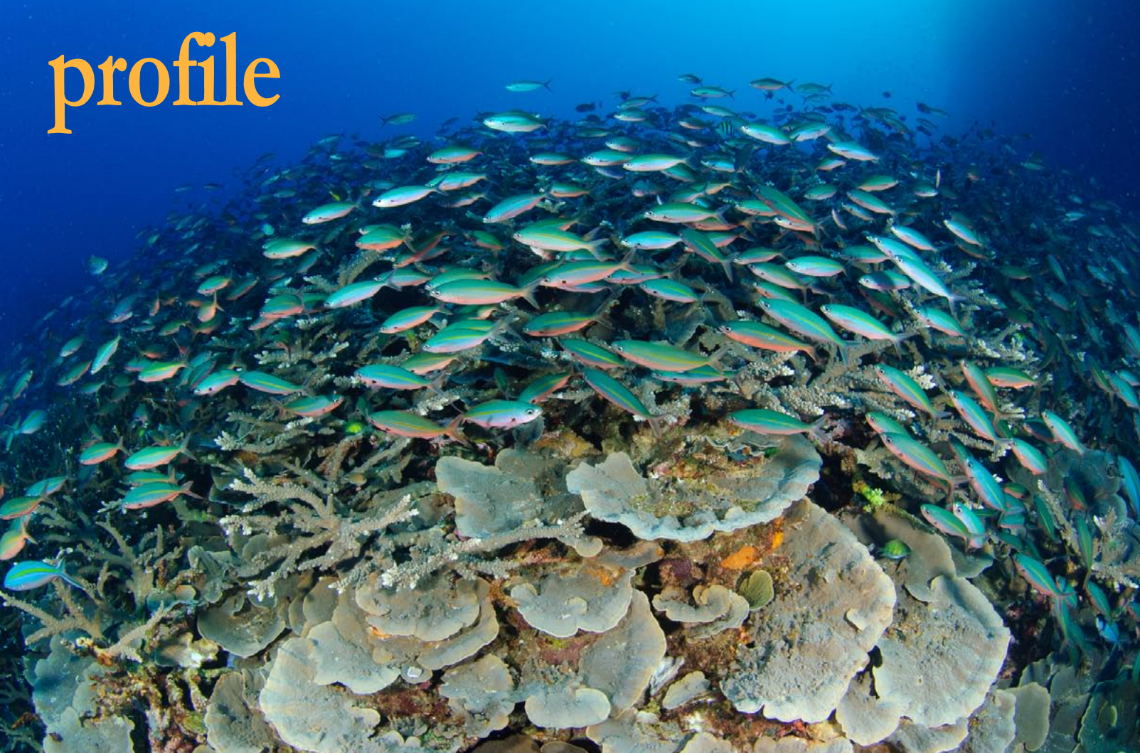
Fusilier schools are in abundance on Raja Ampat's reefs; Giant barrel sponge at Four Kings, Misool Region (lower left)

ME: One of our flagship programs in Raja Ampat has been the Kalabia program. You can also see more about it at the following link: blog.conservation.org