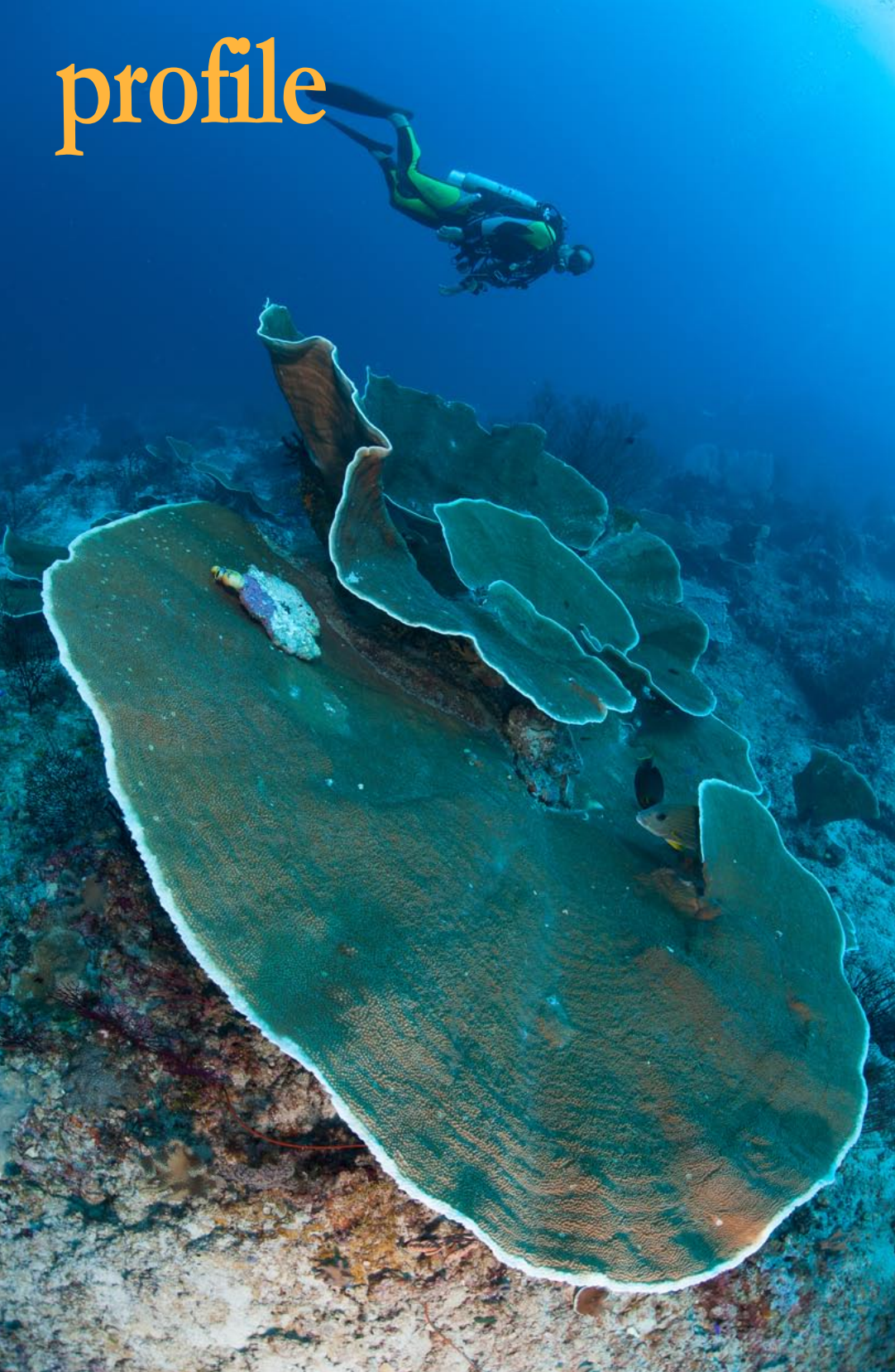
Hard coral growth at Jamur Boo, near Misool (left); Sunset at Wayag (below)