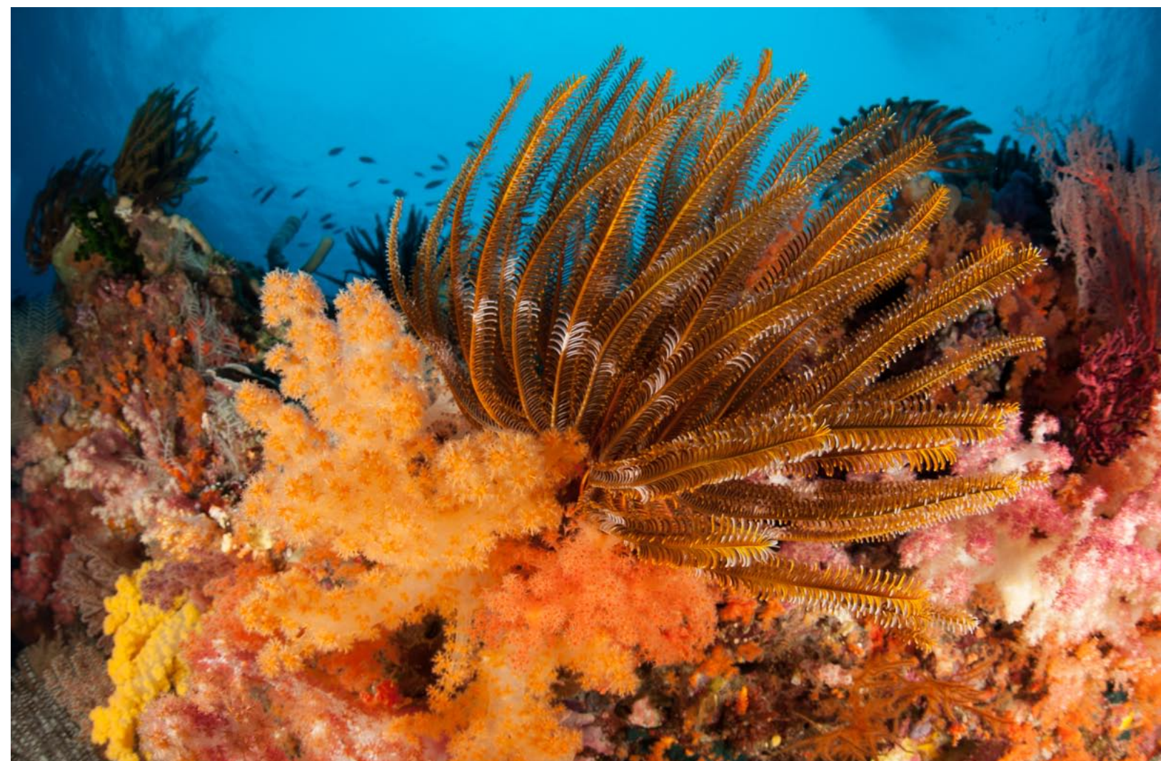
Crinoid and soft coral growth in the Misool Region

schools and do schools currently teach the value of the marine ecosystem for the long term well being of the Indonesian nation?