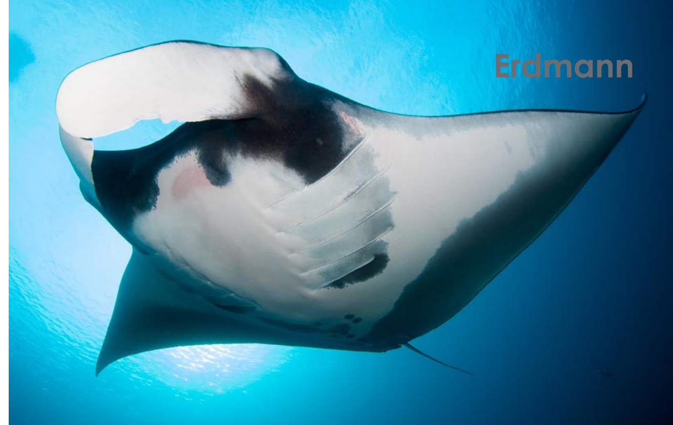
Soft corals at Citrus Ridge, near Waigeo in the north (left); Manta Rays at Blue Magic (above)

We moreover hypothesize that this region is, in fact, an active cauldron of evolution, or “species factory”, which is, as we speak, still generating novel biodiversity. As diversity provides the building blocks for adaptation to global change (climate, etc), it is imperative to maintain as much diversity as we can to give reefs and, in fact, humans the best chance of surviving the coming changes facing our planet. If the Bird's Head is not properly managed, we'll lose this repository of diversity.