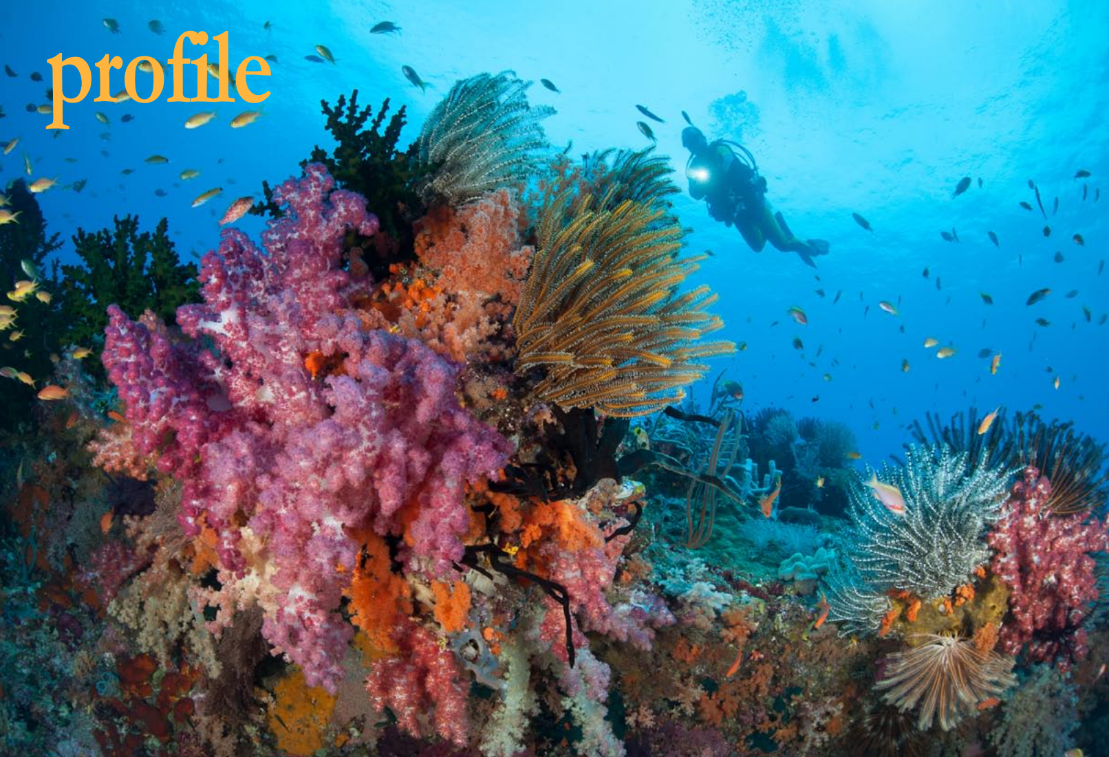
The spectacular colours of the south of Raja Ampat (left); Intense fish action at Mike's Point, one of the most spectacular dives in the Dampier Strait (below); Sweetlips school on the deep bommies at Cape Kri (lower right)

SJ: Given its position at the epi-centre of marine biodiversity, what will be the likely cascading impact to other regions, if the Bird's Head marine environment is not successfully managed?