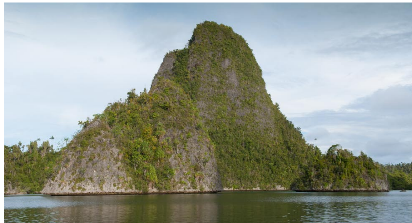
Limestone islands at Wayag

when I was doing my PhD work in the early 90's were actively finning around Raja Ampat even back then. However, Raja Ampat has now implemented the first shark and ray sanctuary in the Coral Triangle (across all of its waters), and the regency law #9/2012 (passed in December 2012 and announced in February 2013) provides serious legal sanctions (and NO LOOPHOLES!) for