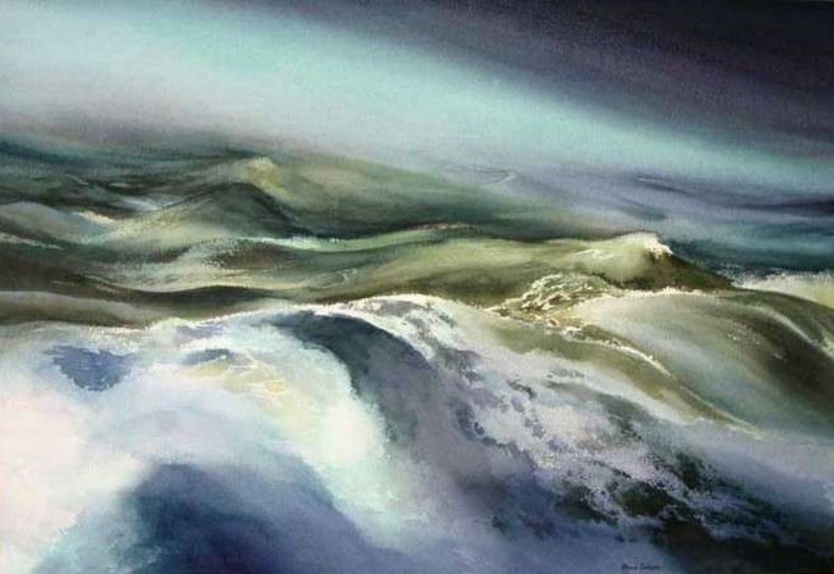
La vague by Pierre Sentjens Watercolor on paper 70 x 100cm