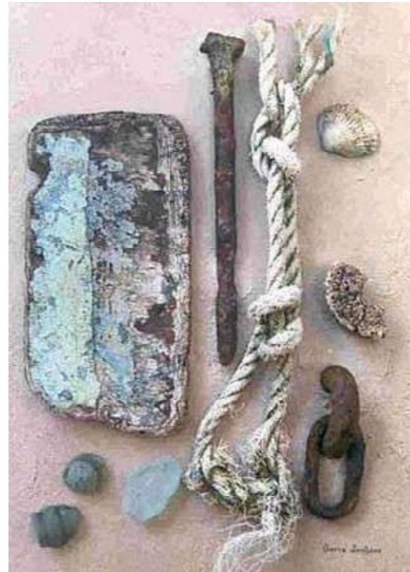
Rebus , Bas-relief on board, 40x30cm