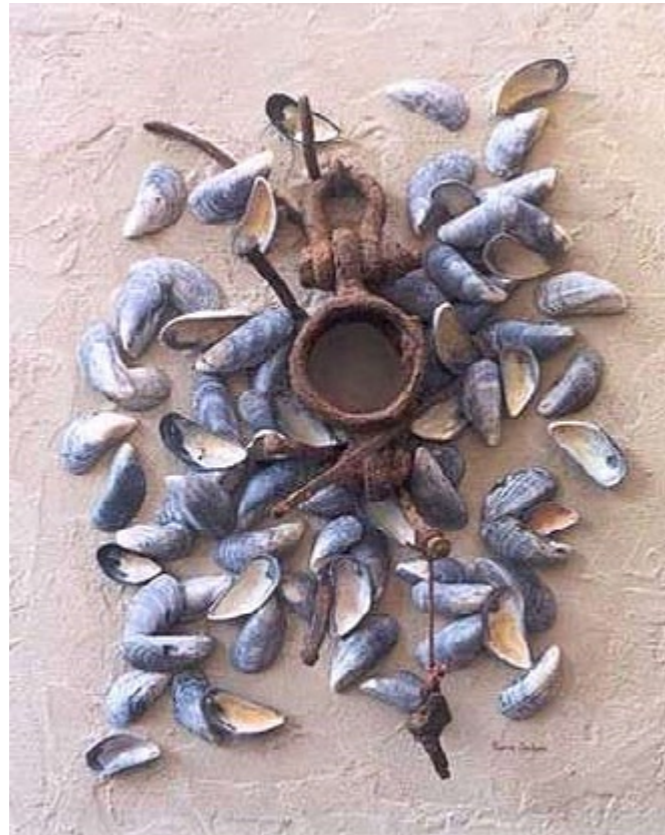
Le repas du naufragé , Bas-relief on board, 60x50cm