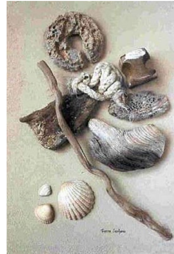
Offrandes , Bas-relief on board, 50x40cm

the sea since I was a child. All the seas I crossed appealed to me—the winds of the Orcads in the North of Scotland, the emerald waters of the Caribbeans, the deep blue of the Mediterranean Sea, the unfathomable Atlantic, the volcanic shores of the Canaries where water and fire fight so beautifully, or simply the loneliness of the long misty beaches of the North Sea. I have sailed, swum and fished. I have liked seamen all over the world and shared their meals, supplied by the sea, with delight.