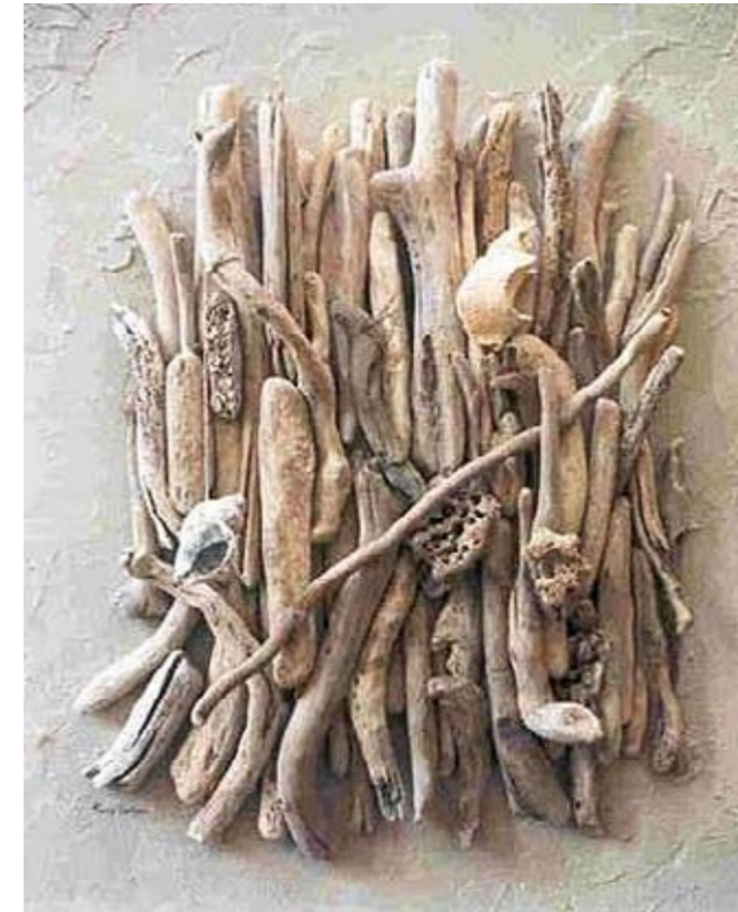
Chorégraphie , Bas-relief on board, 60x50cm