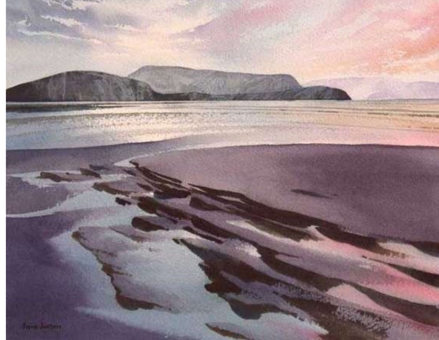
Les Traces (Traces) by Pierre Sentjens. Watercolor on paper, 40 x 50cm