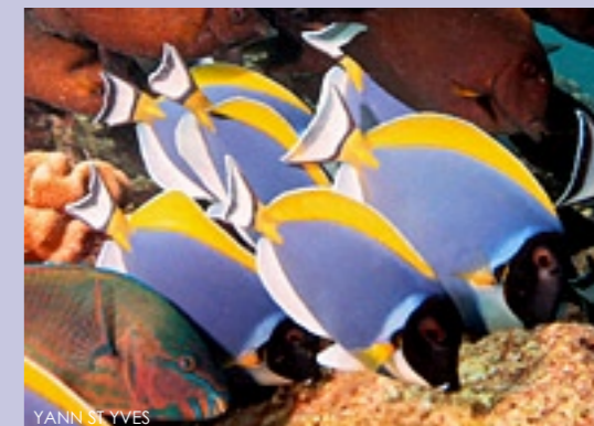
YANN ST YVES