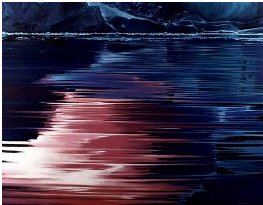
Résonance , by Pierre Sentjens. Acrylic on canvas 120 x 150cm