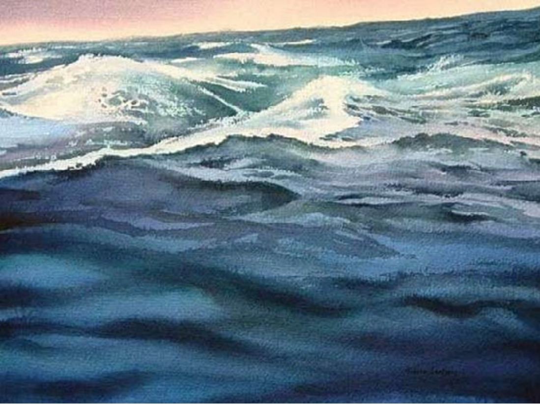
Houleuse (Stormy) by Pierre Sentjens Watercolor on paper 40 x 50cm