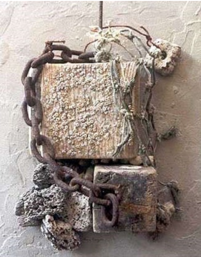
Esclaves , Bas-relief on board, 60x50cm