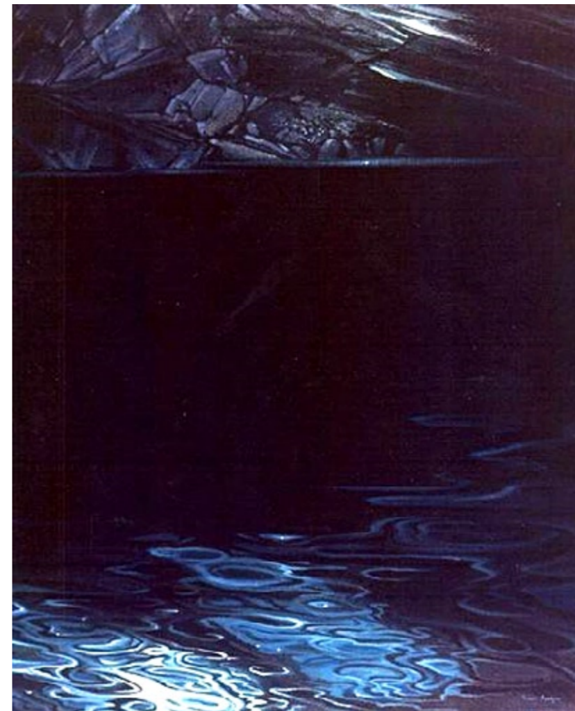
Les Murmures (Murmurs) by Pierre Sentjens Acrylic on canvas, 100 x 80cm

nic groups who were able to live in perfect harmony with nature.