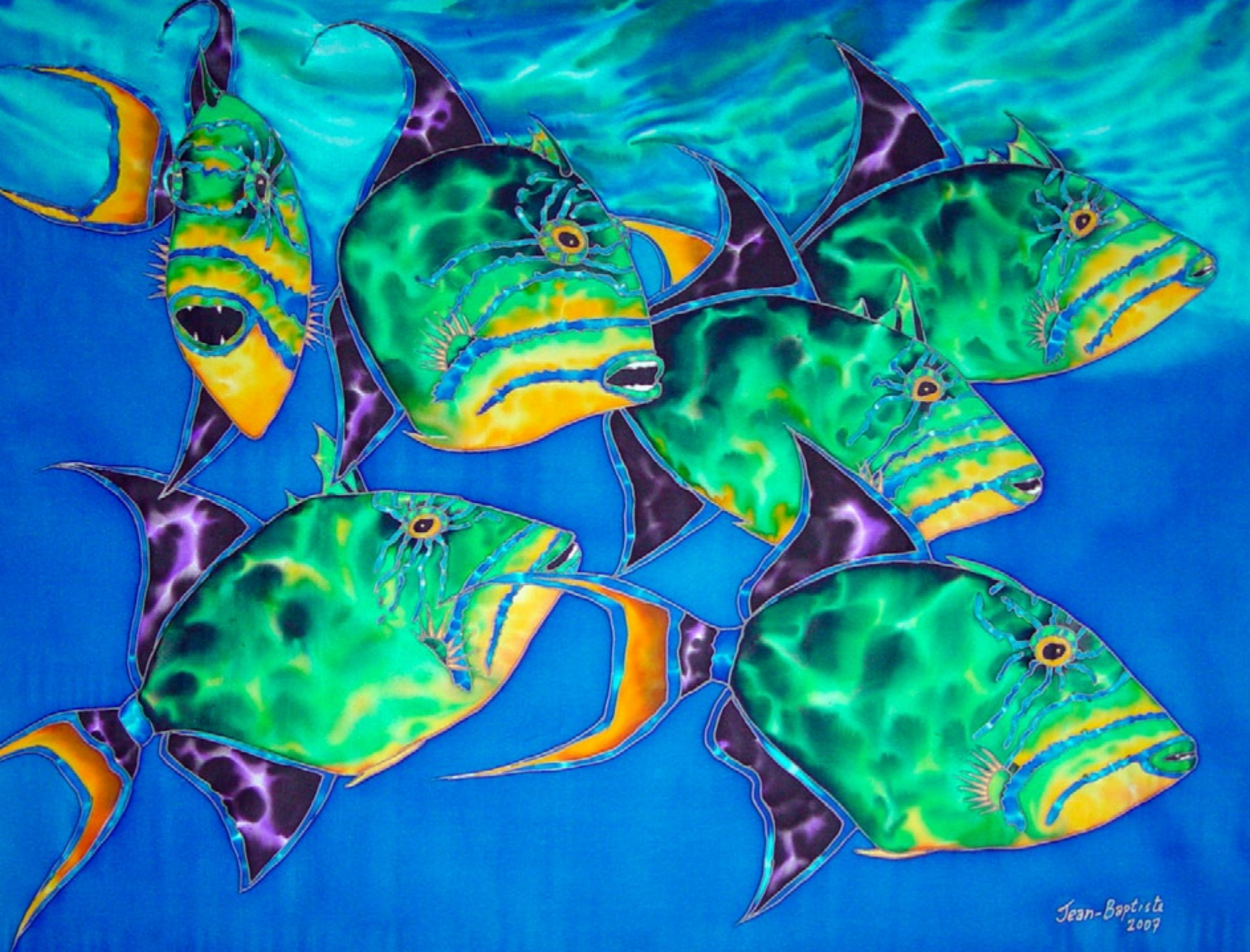
Triggers , by Daniel Jean-Baptiste Hand-painted silk, 30 x 40 inches