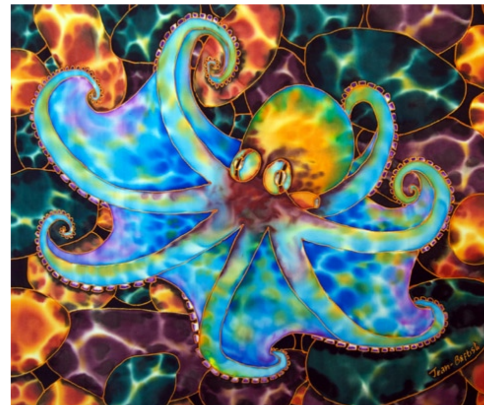
Caribbean Octopus , by Daniel Jean-Baptiste Hand-painted silk 16 x 20 inches