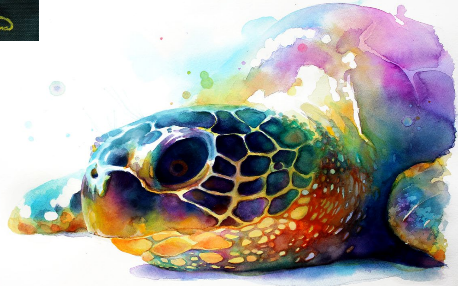
Tranquility, by Darina Denali. Watercolor on Fabriano 300g paper, 35 x 56cm