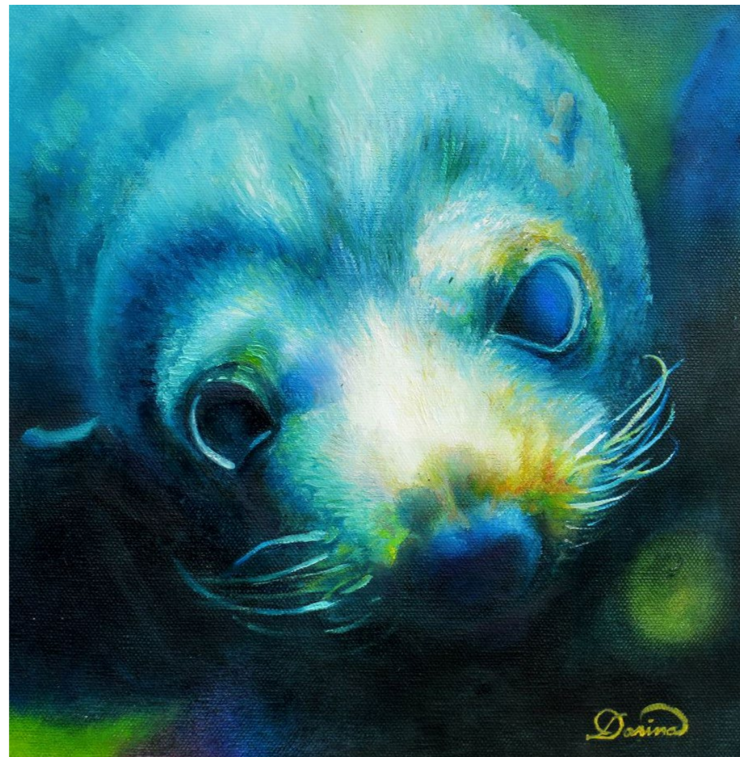
Face To Face by Darina Denali Oil on canvas 30.5 x 30.5cm