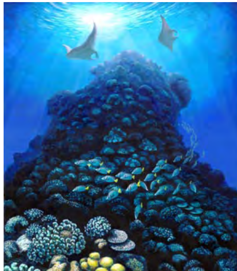
CLOCKWISE FROM LEFT: Escape Marino , 2002, oil on canvas, 65 x 58 inches; Totuga y Nube ; Centallas ; Peces y Atmósfera , 2003, acrylic and oil on canvas, 59 x 44 inches; Roca Mantas

gigantic mural, with plenty of details, and to capture again the emotion, the colour, the energy of the sea and the ocean light.