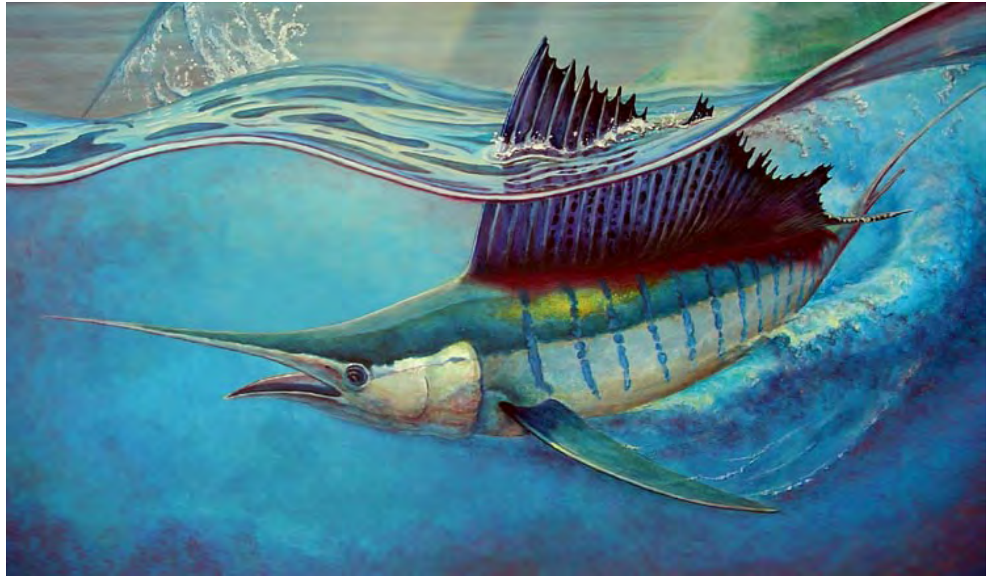
CLOCKWISE FROM LEFT: Confluencia (detail), 2001 Oil on canvas, 56 x 45 inches