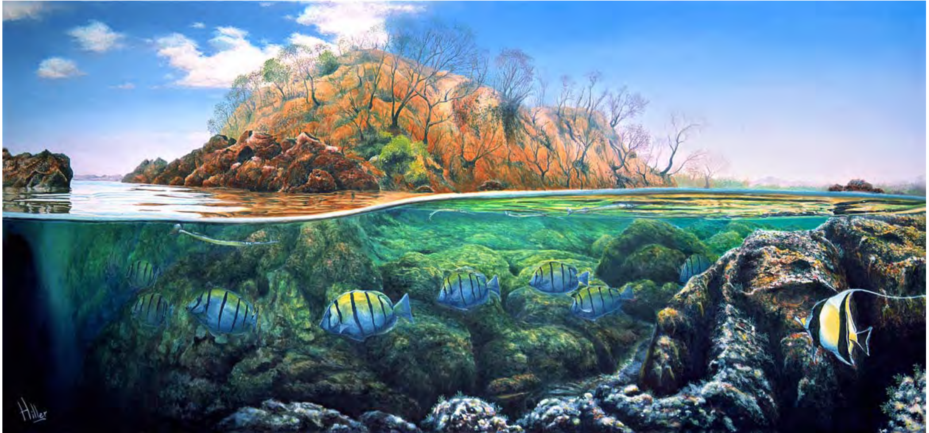
Calma , 2003, by Carlos Hiller. Acrylic and oil on canvas, 59 x 27.5 inches

The art of Carlos Hiller is devoted to the ocean. His paintings bring powerful images brimming with energy and marine life into our daily lives. Huge schools of fish and diverse marine creatures are usually present on his paintings which evoke the mysterious atmosphere of the underwater