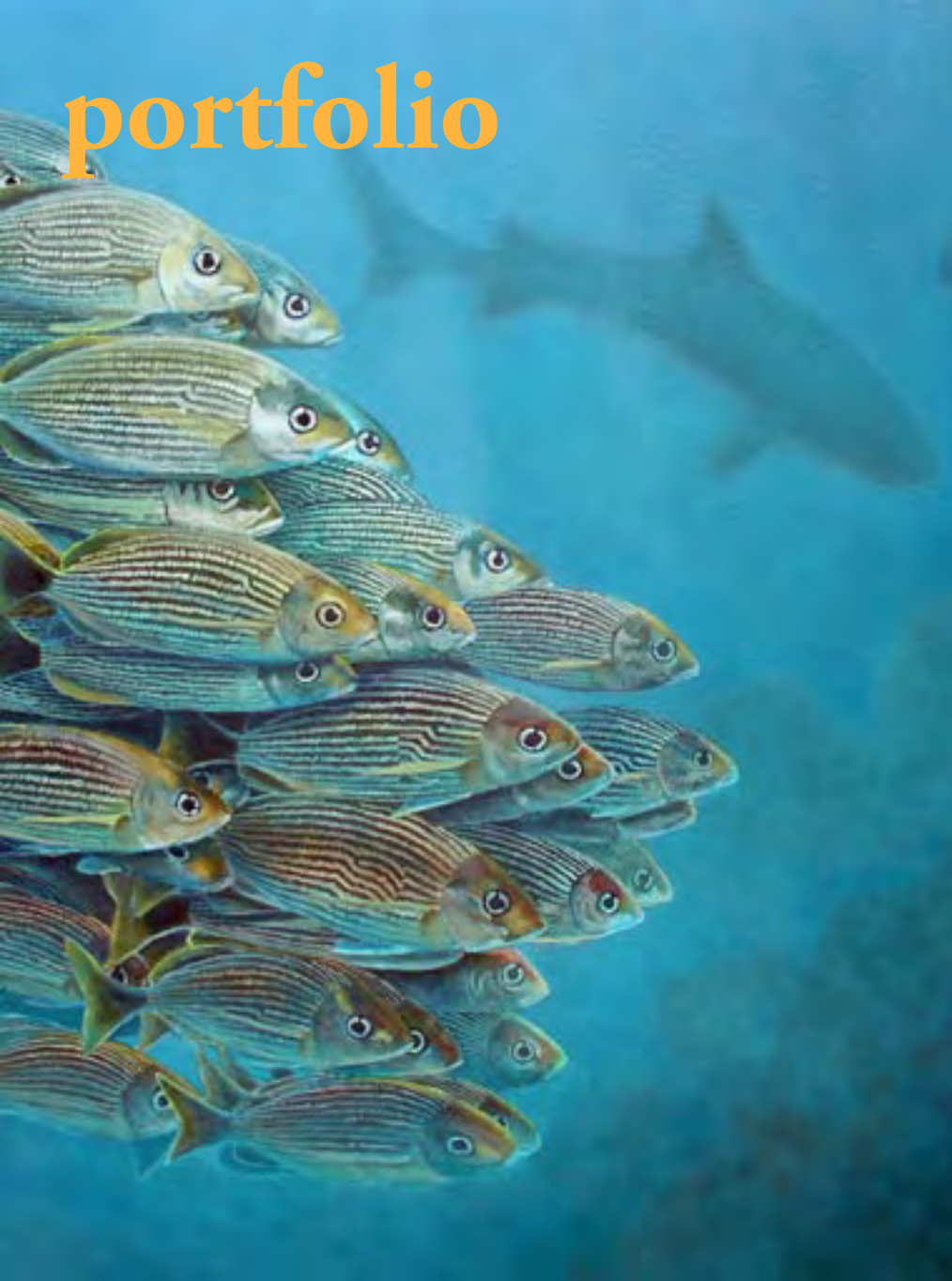
CLOCKWISE FROM LEFT Escuadron (detail) Oil on canvas