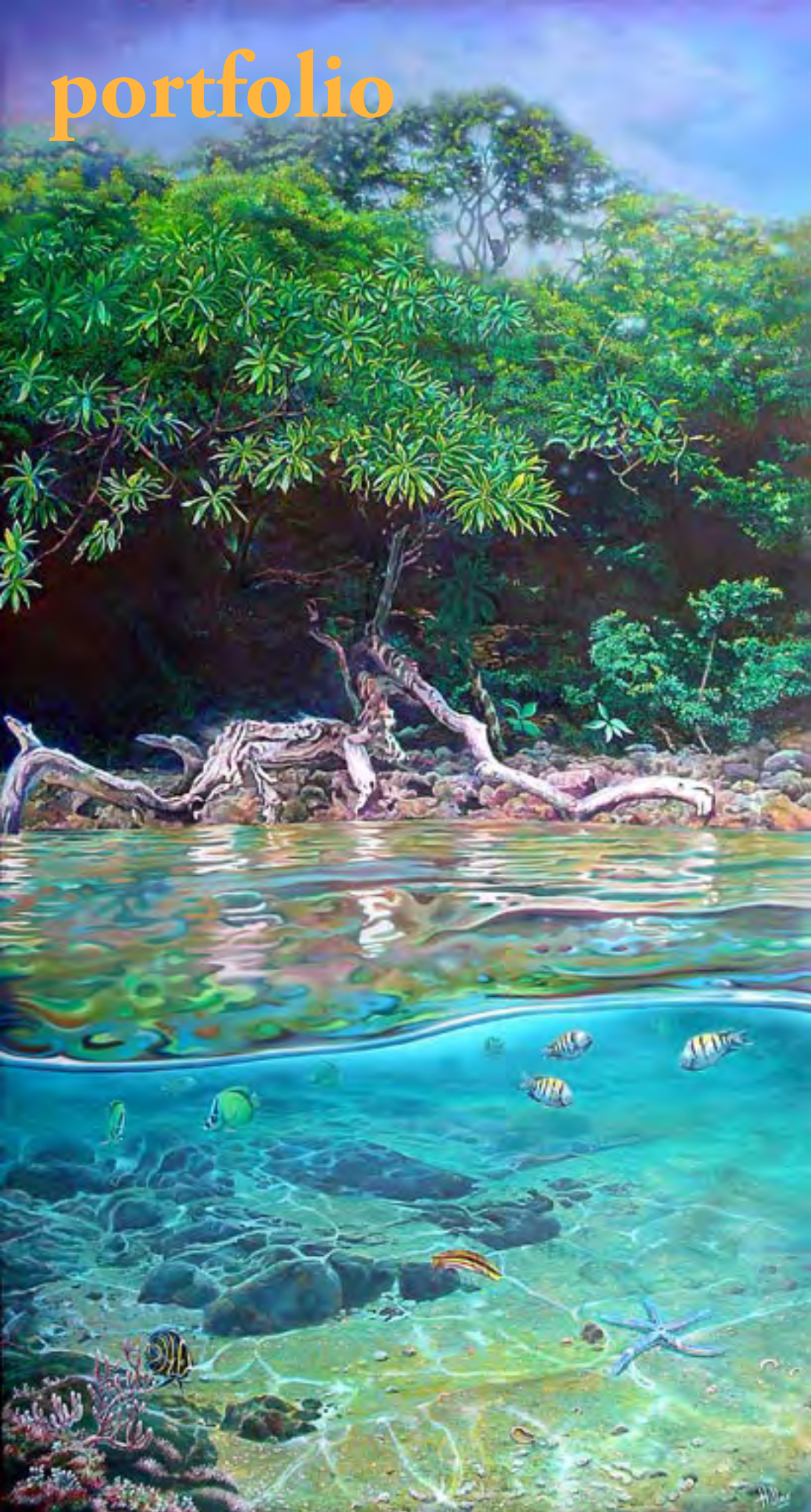
LEFT: Árbol y Mar , 2003, by Carlos Hiller. Acrylic and oil on canvas, 89 x 47 inches BELOW: El Bajo del Coral , 2002, by Carlos Hiller. Oil on canvas, 48 x 72 inches