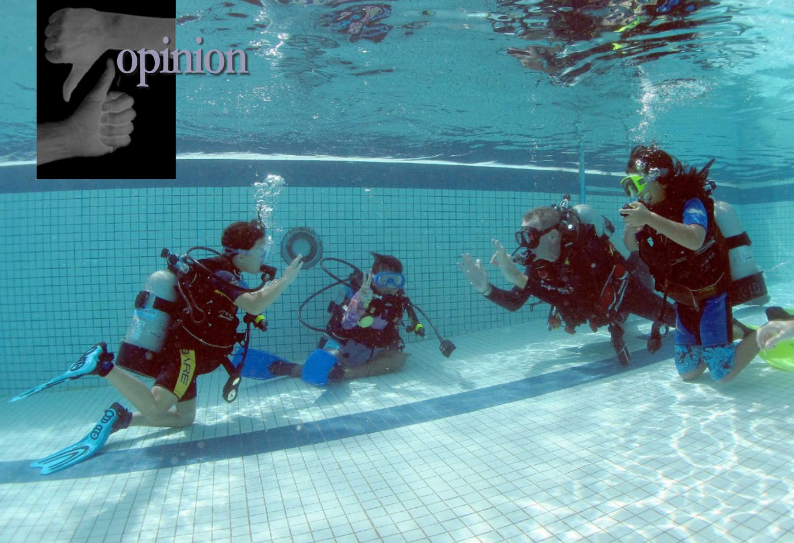
Children practice underwater skills, guided by an instructor, in a PADI Seal Team course with Kids Scuba near Kuala Lumpur