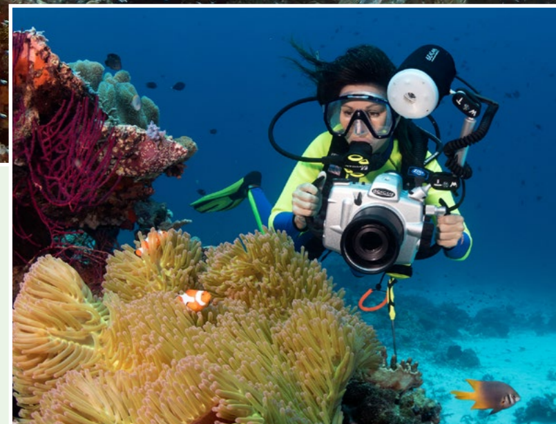
Schools of black snapper are commonly seen roaming the upper portions of Wakatobi's reefs. Photographers (left) find endless opportunities to create stunning macro images. I have found seven species of clownfish on Wakatobi's House Reef alone.

House Reef. If it happens to be running south to north instead, the site known as Turkey Beach makes a clear choice.