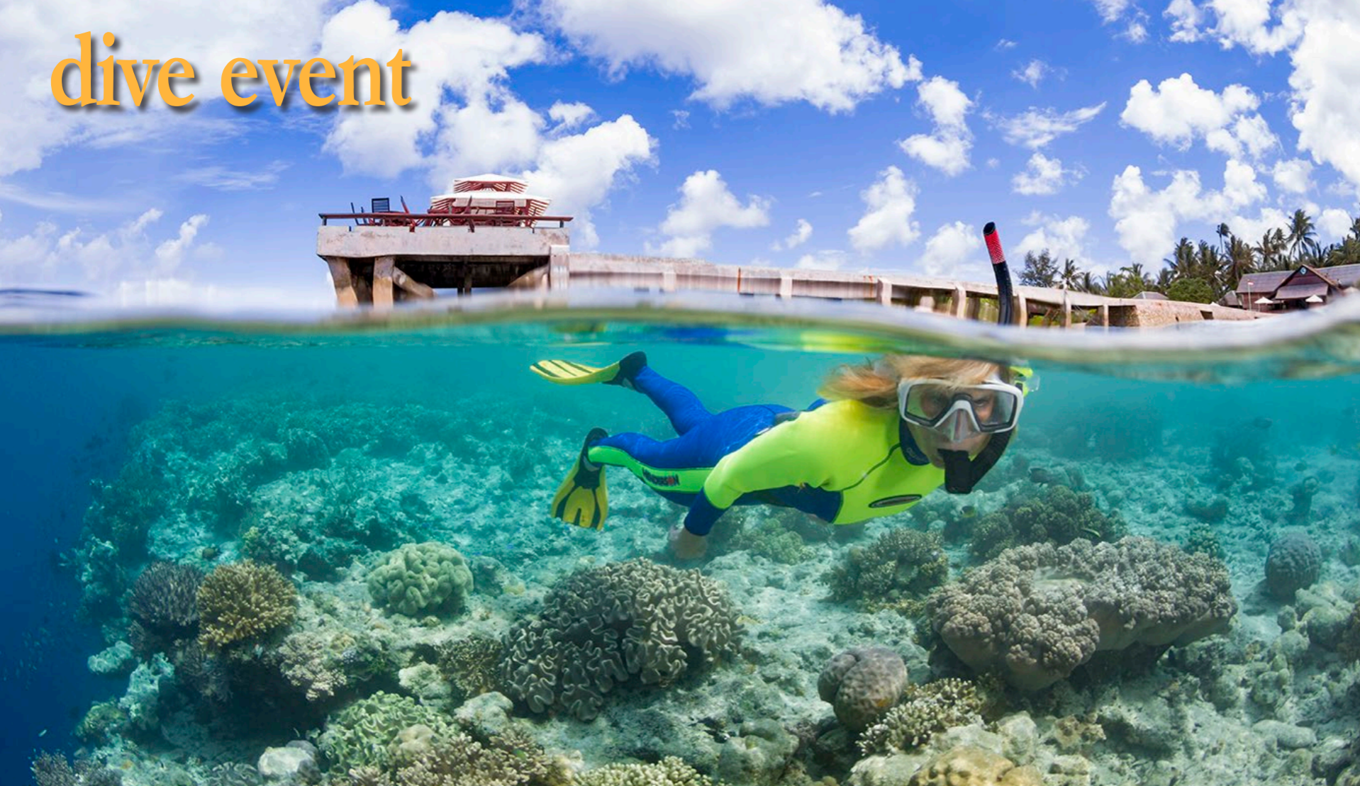
Pristine coral reef around Wakatobi's jetty provides snorkelers with hours of entertainment.