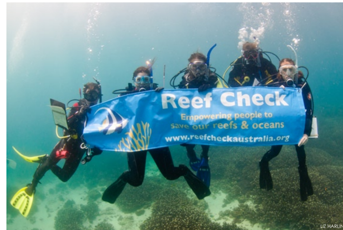
Reef Check Australia volunteers having fun with a serious message

Second, buy a camper-van. If you are on the road 120 days out of 365 traversing the Australian