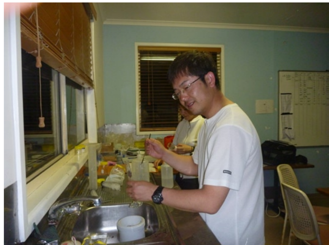
Reef Life volunteer processing samples in the lab

DiVo organises trips and gives information on volunteer diving activities, specifically targeted at the recreational diver who simply wants a dive with a difference without hav-