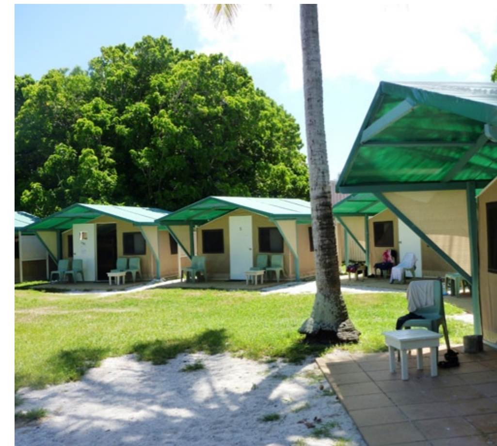
Project Manta had comfortable eco-tent dorm style sharing and food provided under the generous auspices of Lady Elliot Eco-Resort