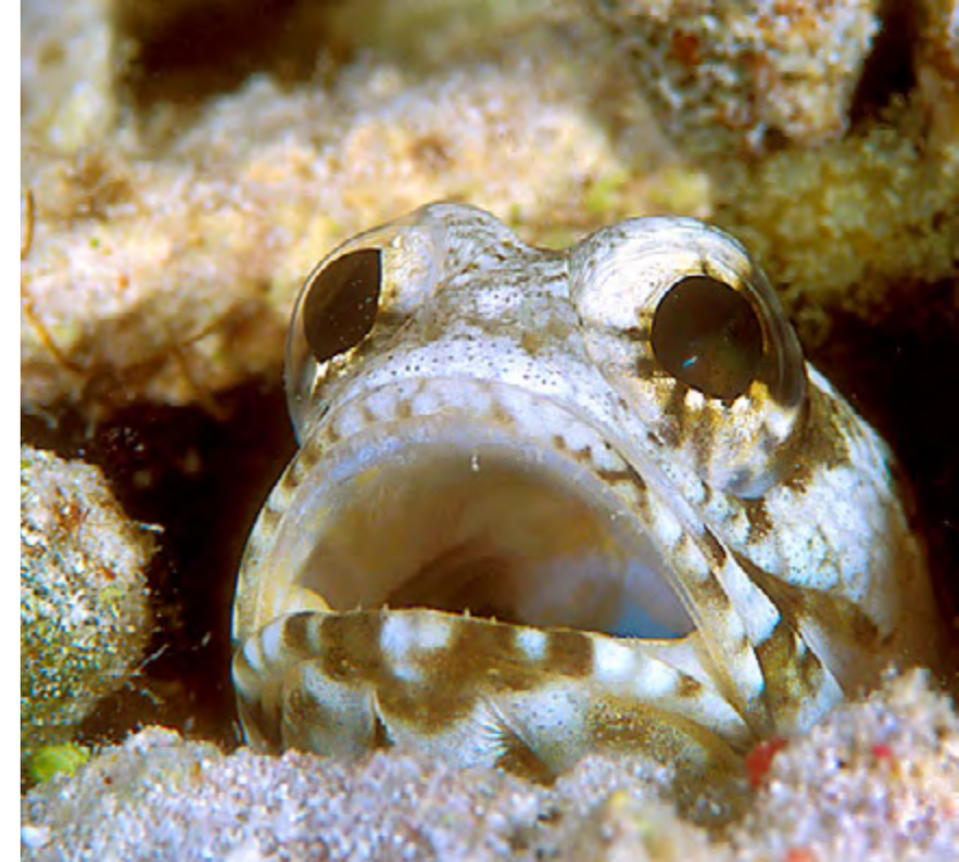
CLOCKWISE FROM FAR LEFT: Yellowtail snapper and sponges; Dusky jawfish startled by my Sea&Sea strobes; spreading sea fan

Though this adventure is at its end, there are still many more tales to be told. In fact, the tantalizing essence of the Turks & Caicos Islands lies in the tales waiting to be born during each and every dive. Be it schooling eagle rays, breaching humpback whales, circling sharks or monolithic pillar corals, the waters surrounding these islands are brimming with imminent encounters. And, while you may not find jewel-encrusted chests overflowing with gold doubloons, the experiences you will share with your own mateys are the real treasures of Turks & Caicos. ■