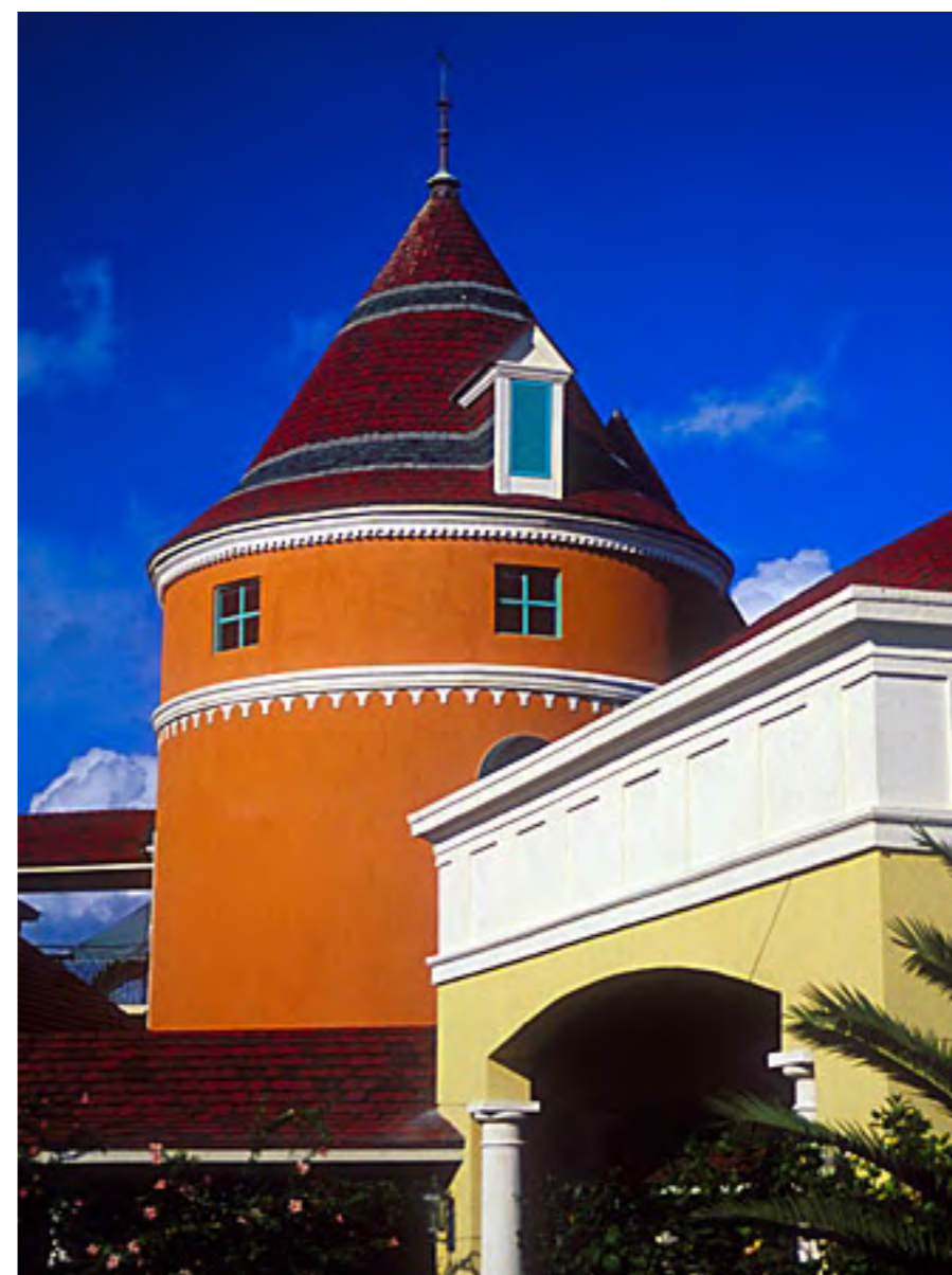
Beaches Resort turret (above); yoga at Club Med Turkoise (bottom left)

The land may be somewhat nondescript, but the