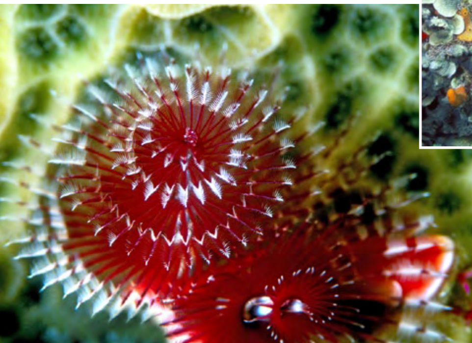
Divers watching Great barracuda under the boat (top); Christmas tree worm (bottom)