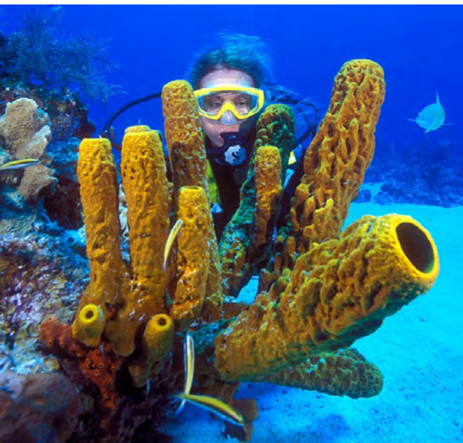
Diver studying Tube sponges

Climate Turks and Caicos Islands have a tropical marine climate, which is sunny and relatively dry while moderated by trade winds.