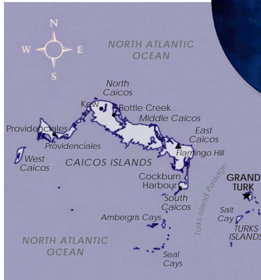
RIGHT: Location of the Turks & Caicos Islands on global map BELOW: Map of the Turks & Caicos Islands

Geography Turks and Caicos Islands are located in the Caribbean. They are comprised of two island groups in the North Atlantic Ocean, southeast of The Bahamas and north of Haiti. Coastline: 389km. Terrain