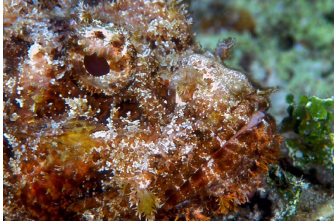
LEFT TO RIGHT: Tonya Streeter examining Pillar coral; Yellowhead jawfish singing opera; scorpion- fish frowning

big eye jacks feverishly rubbing against the largest shark's flanks. Whether utilizing its abrasive skin to remove parasites or relying on gang warfare tactics to drive it away from the school, the interesting behavior added to the dive site's well-deserved reputation. Without a doubt, Rock 'n Roll was aptly named... unless, of course, it could be changed to Pirates' Rock n' Roll Rendezvous.