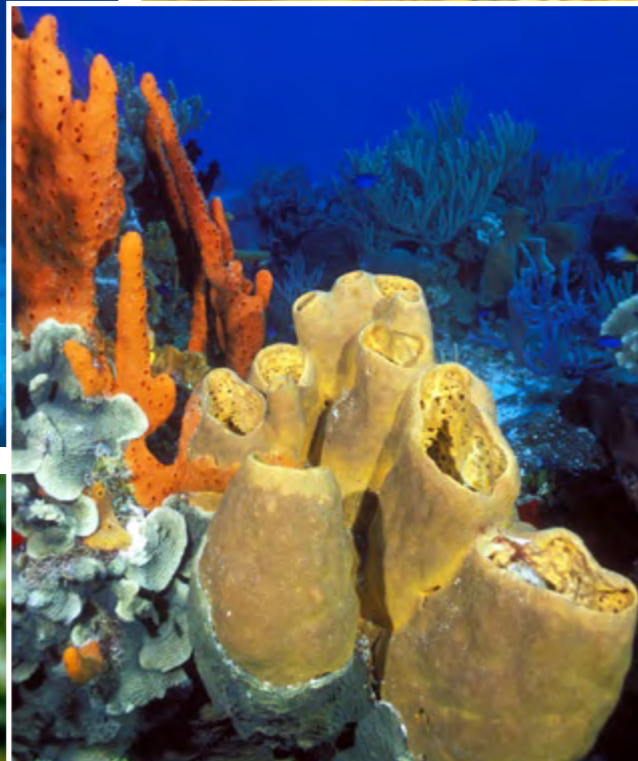
Variety of sponges (left inset); Coral grouper on sponge (above)

Olympic skaters or synchronized swimmers, I would've scored their performance a 10.0. Watching this action through my viewfinder, I composed and shot. Flashing strobes did not phase the sharks, so my compact flash card filled quickly.