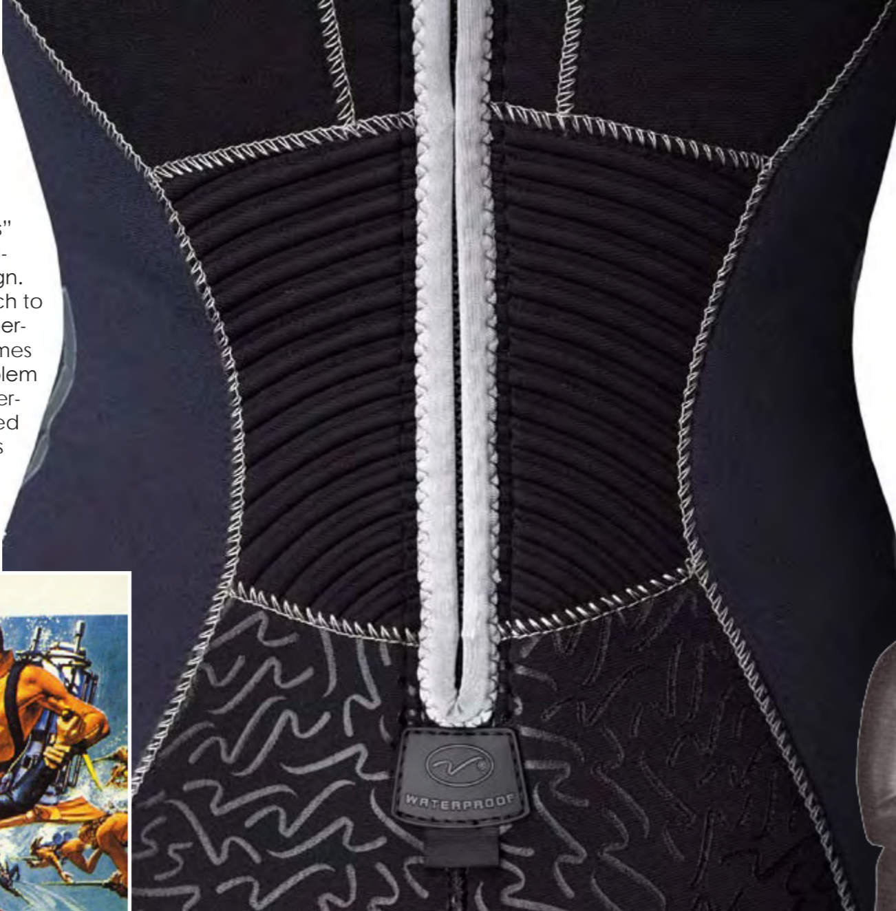
Stretch panel on a modern suit

New materials in the last few years have given the diver the benefit of “full stretch” neoprene suits, which have spandex added to the material that is able to more closely fit the diver’s body. But a possible liability of these new “super stretch suits” is the temptation for the manufacturer to utilize the materials as a quick fix for poor design. Remember also that as a suit needs to stretch to fit over problem fit areas, the insulation properties become less effective, as the suit becomes thinner. Another potentially dangerous problem that can occur as a diver squishes him- or herself into a suit that is just a bit tight is increased resistance effort in breathing underwater, as the wetsuit constricts the diver’s potential lung volume (remember your first instructor taught you to breathe slightly slower and deeper underwater from a regulator).