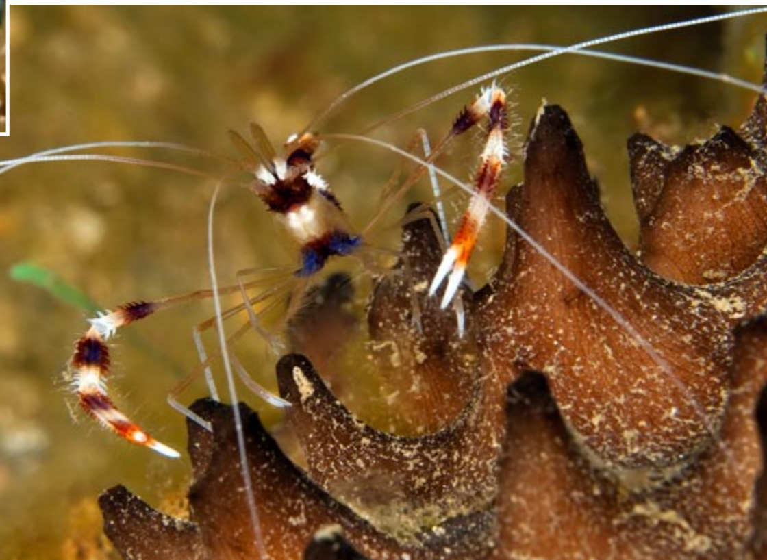
CLOCKWISE FROM LEFT: Entwined nudibranchs; Commensal shrimp, Periclemenes magnificus ; Cleaner shrimp hiding in coral; Banded boxer shrimp

not too cold, because too hot means siltation which the critters don't like very much, and too cold means not enough organic nutrients. Tasi Tolu is obviously just right, because it's a great site with lots of critters to see, but the drainage channel would have raised the temperature to the boiling point during the wet season and effectively decimated the site.