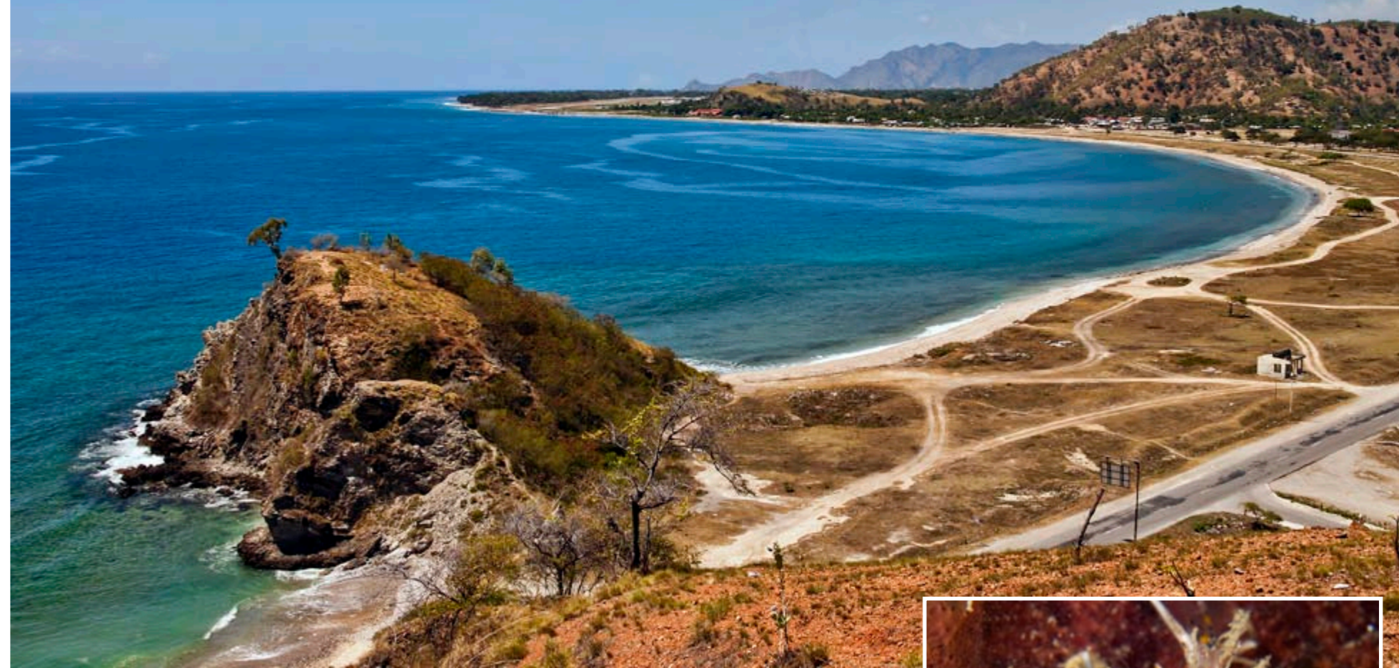
Thorny seahorse; Seaside view of Tasi Tolu in Timor-Leste; Tiny tiger shrimp just under 2cm (right)