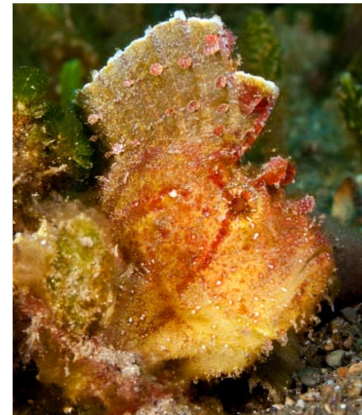
Leaf fish (or paperfish)

Population 1,177,834 Ethnic groups: Austro-nesian (Malayo-Polynesian), Papuan, small Chinese minority. Religions: Roman Catholic 98%, Muslim 1%, Protestant 1% (2005). Internet users: 2,100 (2009)