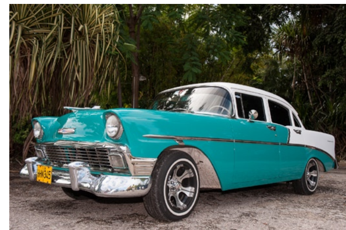
1956 Chevy parked at Hemingway Museum

in the early 1990s. Years of electrical blackouts and limited fuel to run machinery or automobiles brought about food shortages and desperate times for a people accustomed to state provided nourishment and health care. Tractors gave way to ox and plows, and cars were replaced with horse-drawn carriage-