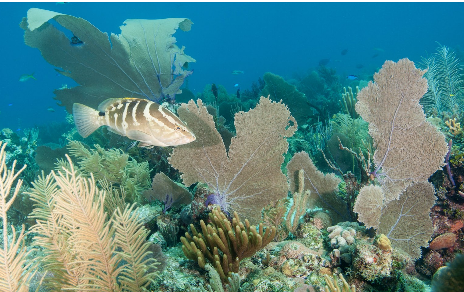
Nassau grouper swimming amongst several large sea fans on the coral reef; Diver and large pillar coral (right)