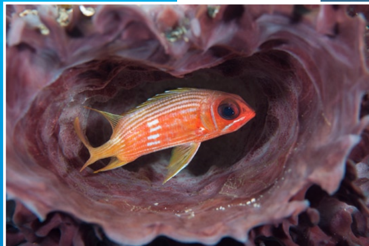
Longspine squirrelfish hiding inside a purple tube sponge