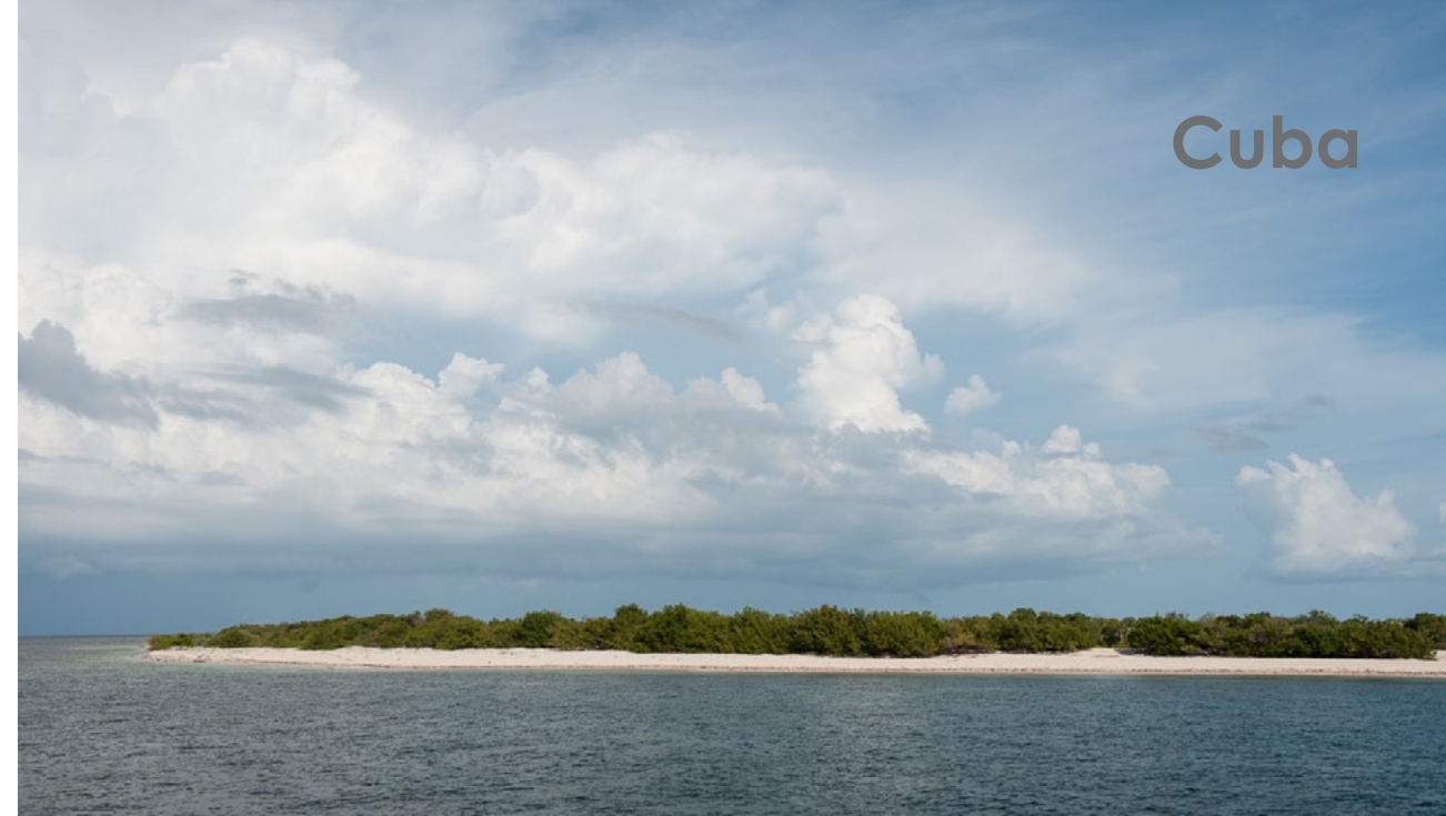
Colonies of red mangroves (left) grow in the shallow water between islands; Cuban hutia (above) climbing in the bushes at the edge of a sandy beach, also known as tree rats; Late afternoon cloud formations (right), indicating a pending rain storm, gather over a tropical island in the Gardens of the Queen