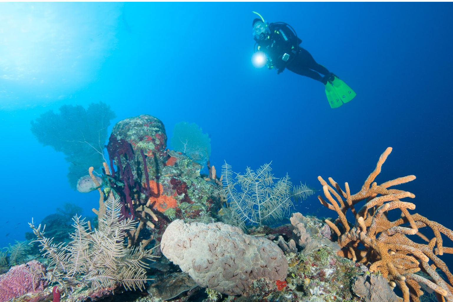
Diver at deep water pinnacle of sponges, sea fans and encrusting corals; Large colony of elkhorn coral (top)

suffered the effects of global warming. With luck the discoveries made here will help restore other areas to the pristine conditions we experienced on this amazing trip.