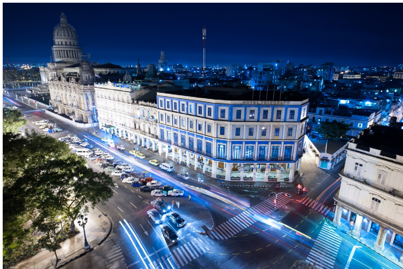
Night scene of Central Park, the Capitol, Gran Teatro, Hotel Inglaterra and Hotel Telegrafo