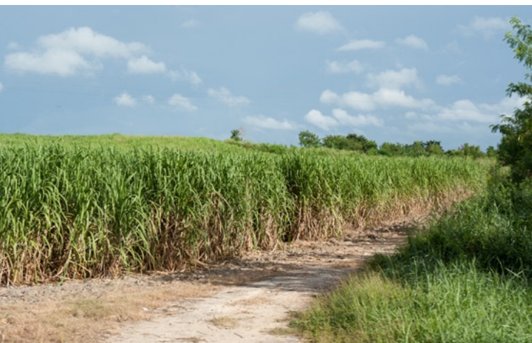
Field of sugar cane in the Cuban countryside along the route from Havana to Jucaro; Children play volleyball (right) on a cement playground at a local school in the fishing village of Jucaro; Cuban iguana's resting on a sandy beach (far right)