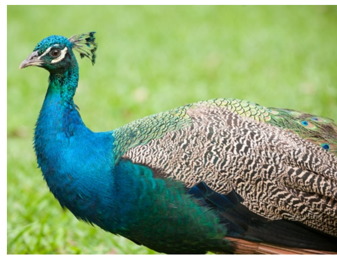
Peacock on the grounds at Las Terrazas

Started in 1967 as a government reforestation project—following years of land clearing for a coffee plantation, and later, charcoal—the roughly 1,200 residents have replanted over eight million trees, encompassing 24 different species. The surrounding hillsides are lush with vegetation once again, and the villagers utilize conservation-minded sustainable practices to ensure they stay that way. Our guide led us on a tour of the grounds where we visited a primary and secondary school, community center,