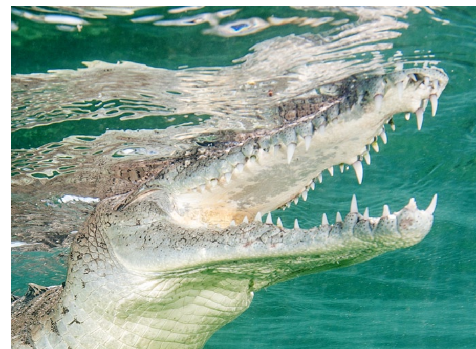
American crocodile floating on the surface with its mouth open

to discuss sports on a lazy afternoon and locals assembled around games of checkers and dominos on marble park benches or an apartment stoop. The newsstand still had Life magazine for