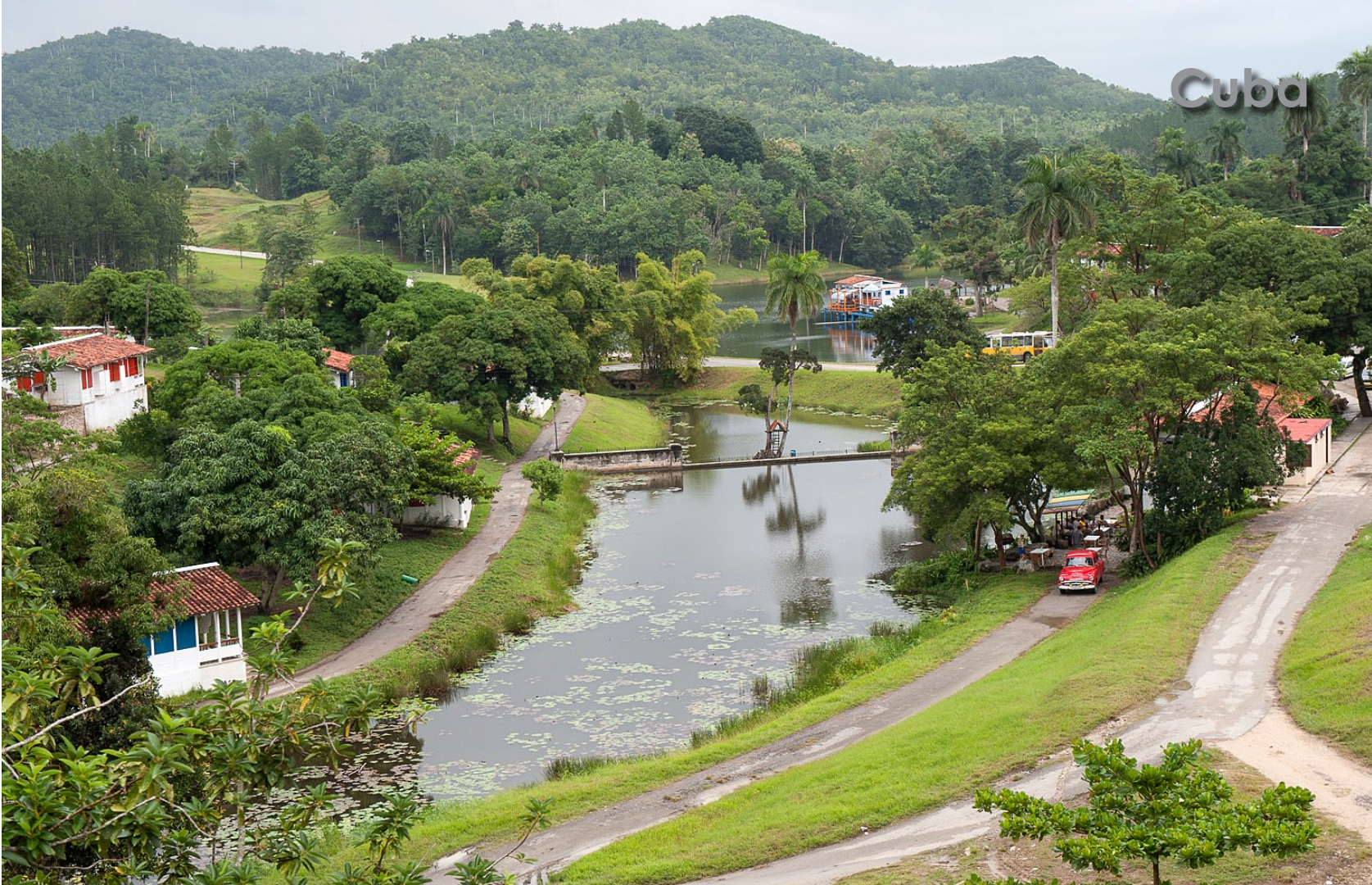
University of Havana research vessel, Felipe Poey , anchored off the Gardens of the Queen while on a three-week research trip; Cuban flag (inset) flutters in the wind, while in the background the sun rises over a tropical island in the Gardens of the Queen; Housing (right) built into the hillside in the sustainable community of Las Terrazas

significance—the majority of which date back to the 19th, 18th and even the 16th and 17th centuries—resurrecting them all will be no easy task.