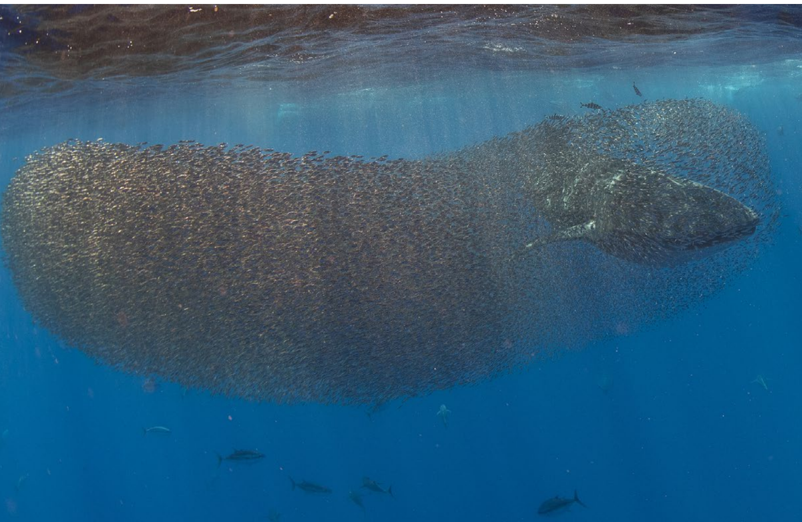
Bait ball of snipefish at the surface (above)

blue Atlantic, with an unshakable objective—the bait ball! Like a movie star making an entrance, the whale shark carved through the water, as if in slow motion, moving towards the bait ball, opening its jaws and sucking in the snipefish.