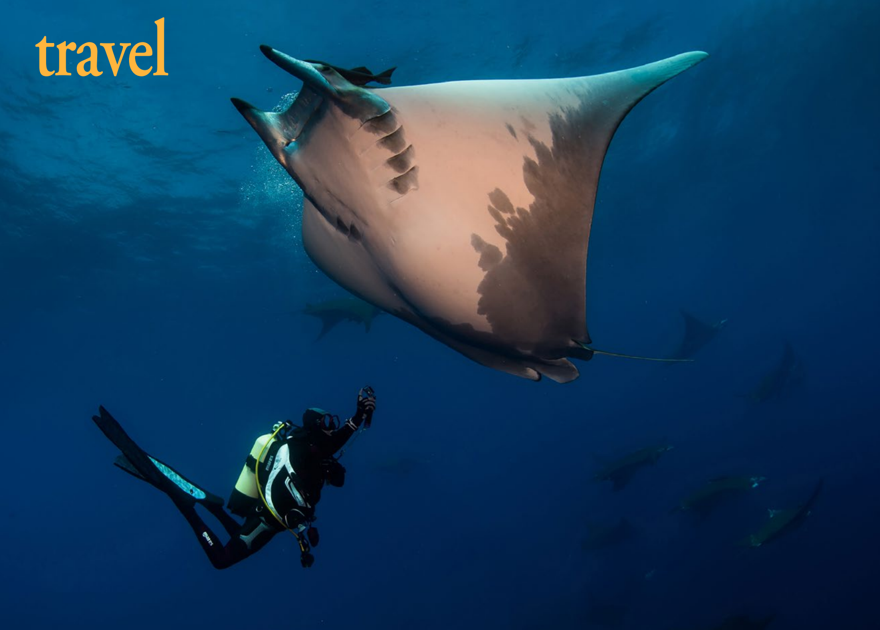
Underwater photographer with mobula rays at Ambrosio. The mobula ray in the foreground appears to be pregnant.

reach the dive sites, with intervals taking place on the dive boat. After the second dive, one can be back in port as early as 2:00 p.m. This gives you time to explore the island by car or scooter and enjoy the local sights and attractions.