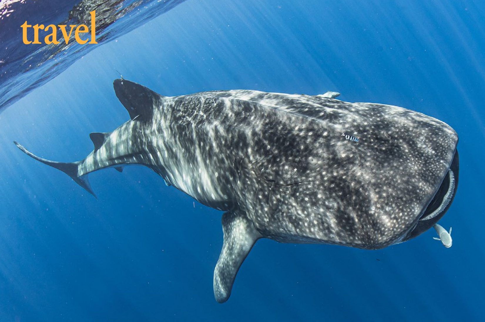
Whale shark with remora

feeding tunas below the surface, and a whale shark coming onto the scene to feed. The whale shark cannot initiate the formation of a bait ball, so it follows the fast-moving tunas, which would drive the small fish up against the surface of the ocean. There, the small fish lose a dimension and are trapped against the surface, thus forming a bait ball.