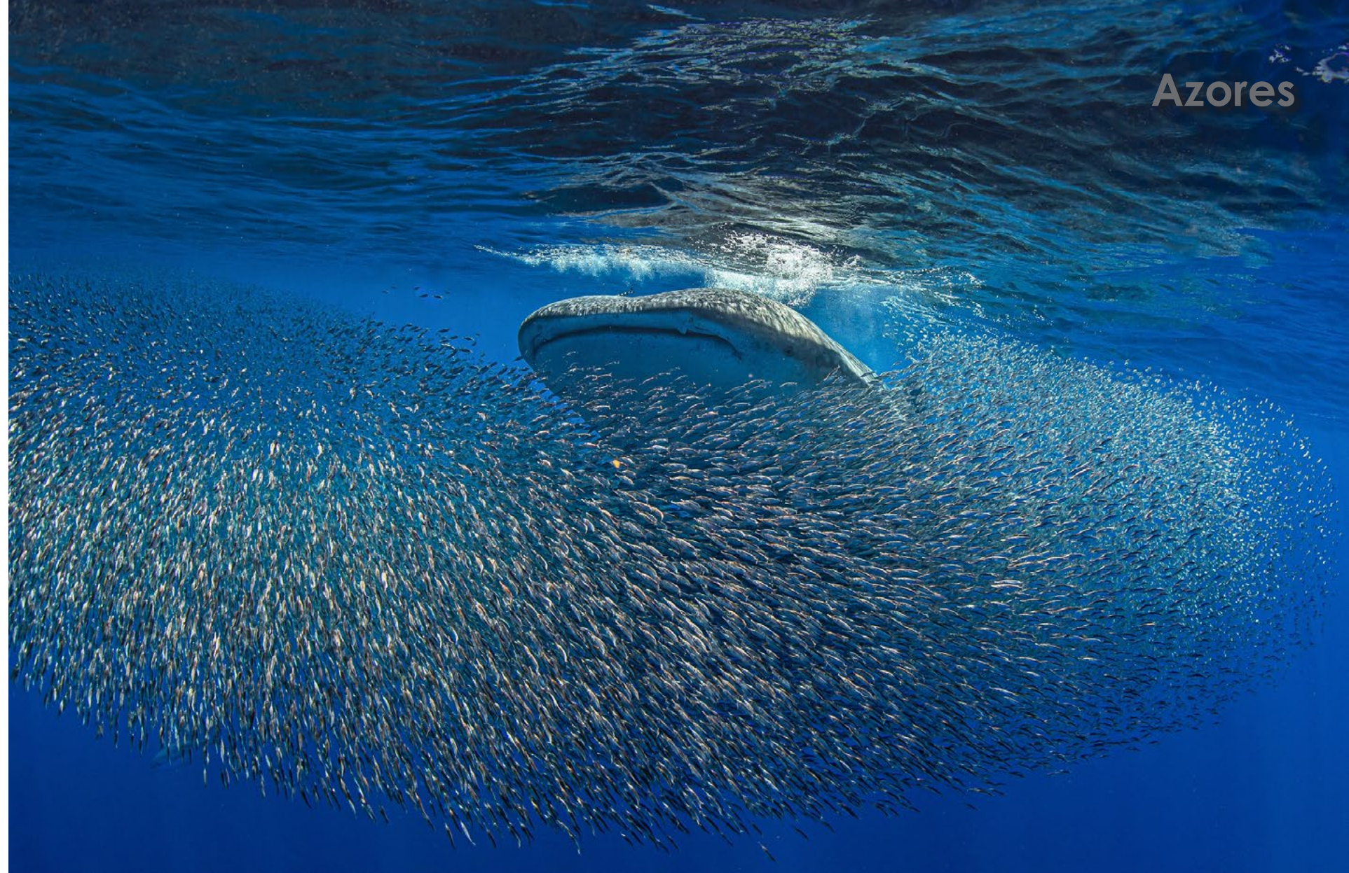
Whale shark feeding on bait ball of snipefish in the Azores (above)

A powerful influencer of climate and ocean currents, the Atlantic Ocean is vast, stretching from the North Pole down to the South Pole. At around the middle of this massive system lie the Azores Islands, about seven hours flight from New York or approximately four hours from Lisbon. The island group comprises nine islands, each with very different characteristics. One thing they all have in common is their nickname: “The Green Islands.”