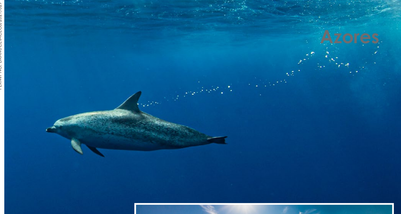
Sperm whale calf (left); Spotted dolphin (above); Picturesque coast of Santa Maria Island (right); Whale shark with pilotfish (bottom left)