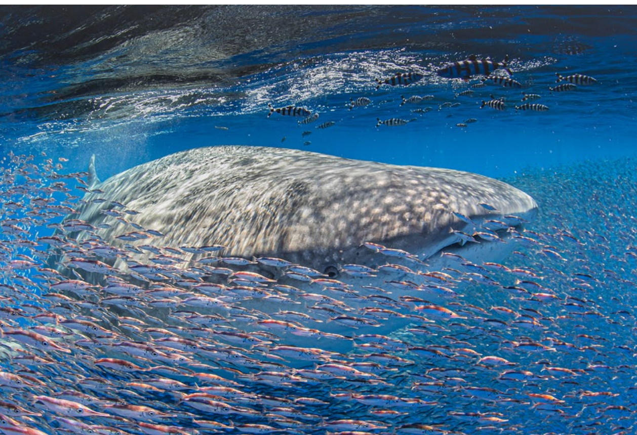
Whalesharks with pilotfish, along with tuna and blue sharks, feed on bait ball (left and bottom left); The tiny snipefish form a bait ball to protect themselves from predators like tuna (right).

of the Atlantic appeared to be boiling, with splashes and sprays visible from afar. To locate these bait balls, the birds were important.