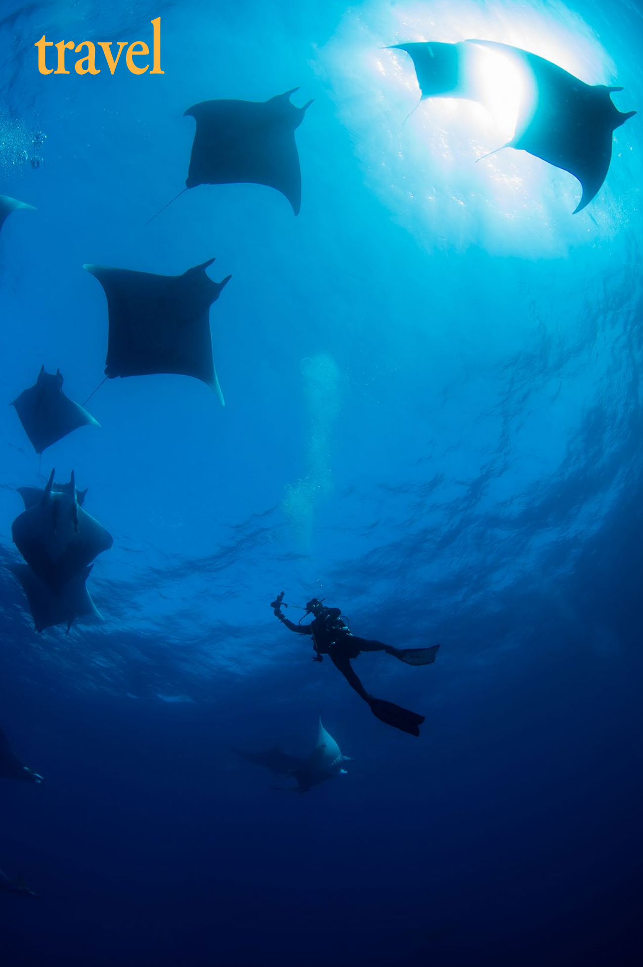
Diver with circling mobula rays, off Santa Maria Island in the Azores (above); PREVIOUS PAGE: Sperm whale with calf (Permit: DRAM/CETACEOS/2021/029)