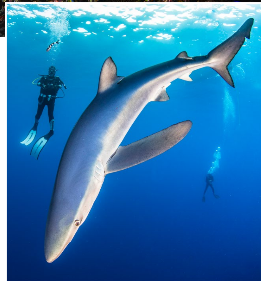
Divers with blue shark (above); School of ornate wrasse, Thalassoma pavo , on rocky reef at Formigas Islets (top right); View over Santa Maria Island (top left); Pair of spotted dolphins (far left); Green sea turtle (centre)

In general, recreational dives are double tank (nitrox is available), and it takes about 45 minutes to