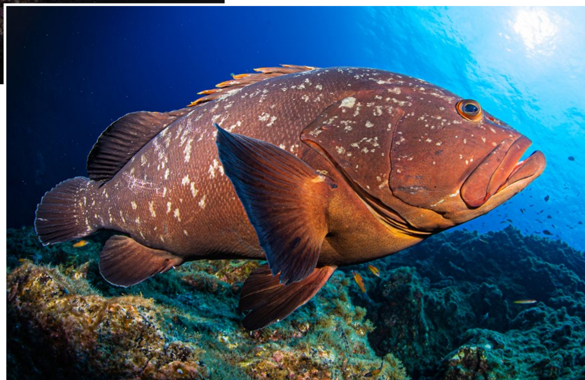
Divers and black coral on wall at Formigas Islets (above); Grey triggerfish (top right) and grouper (far right) at Formigas

us legal permission to photograph these majestic animals.