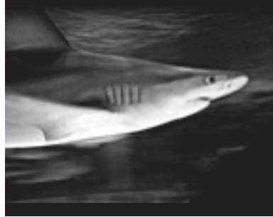
Great white shark during a cage dive in South Africa