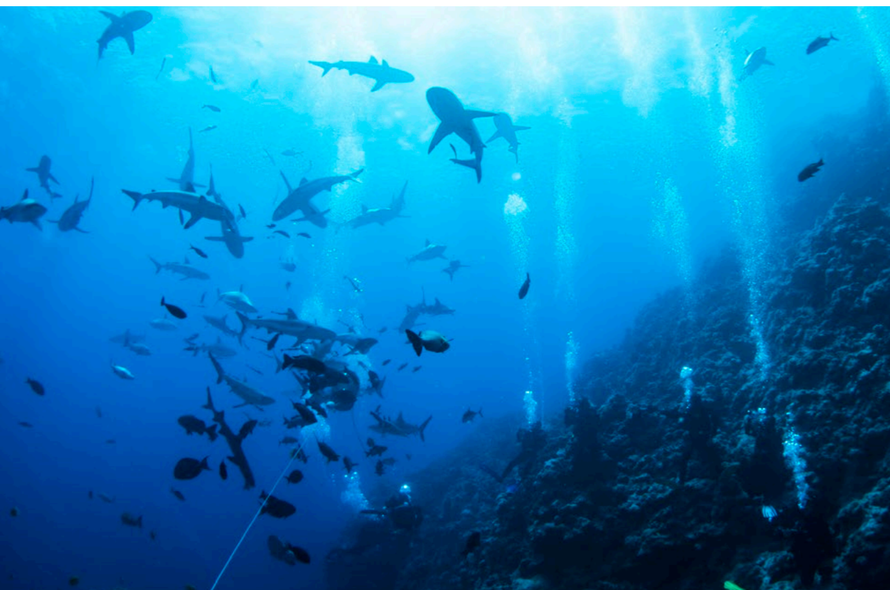
Shark dive at Osprey Reef, Great Barrier Reef, Australia