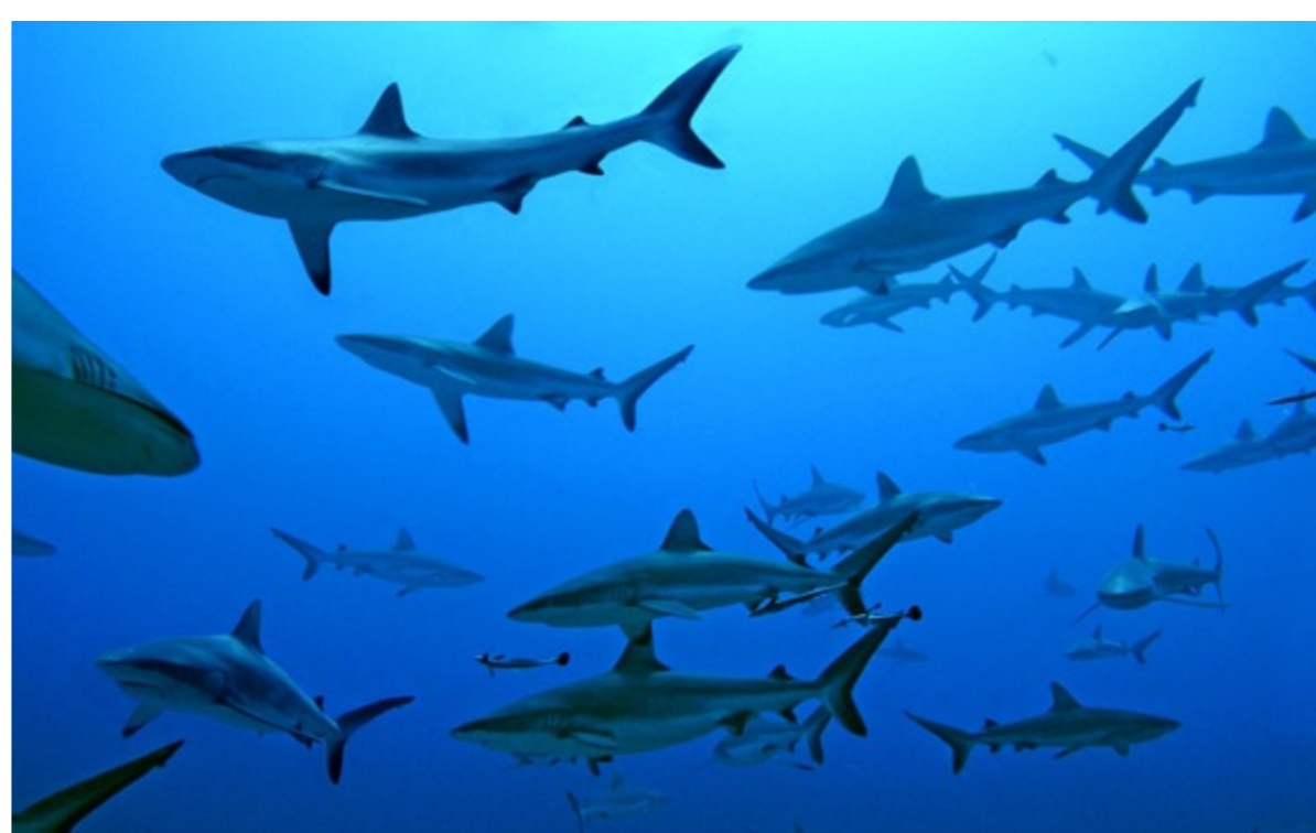
Hundreds of sharks gathering into a lagoon pass in French Polynesia