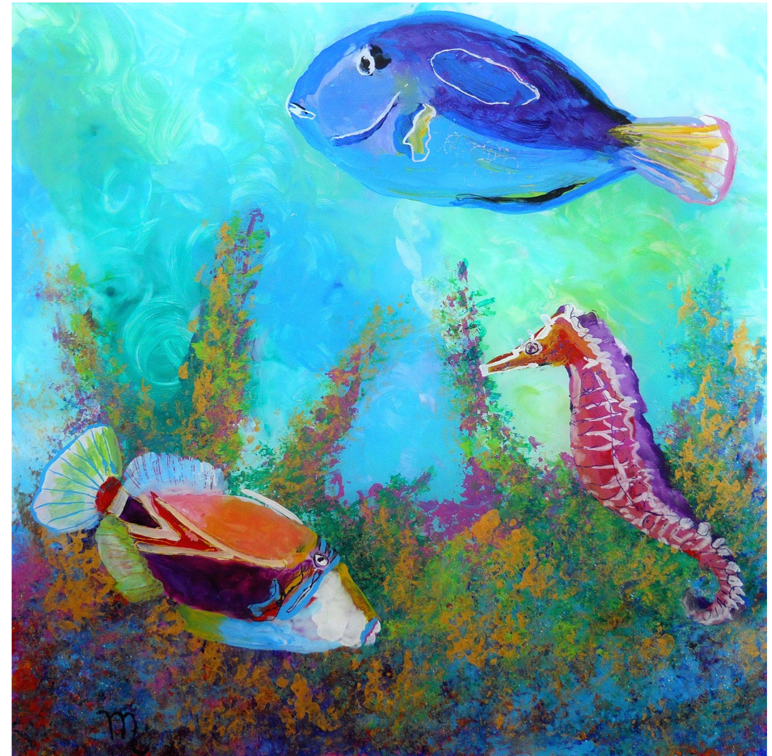
Hawaiian Tropical Fish 3 , by Marionette Taboniar. Reverse acrylics on plexiglass, 12 x12 inches

of Kauai, you are only moments away from its beautiful and breathtaking seascapes. I love to park by the ocean and just watch the waves. You can sometimes see a turtle or tropical