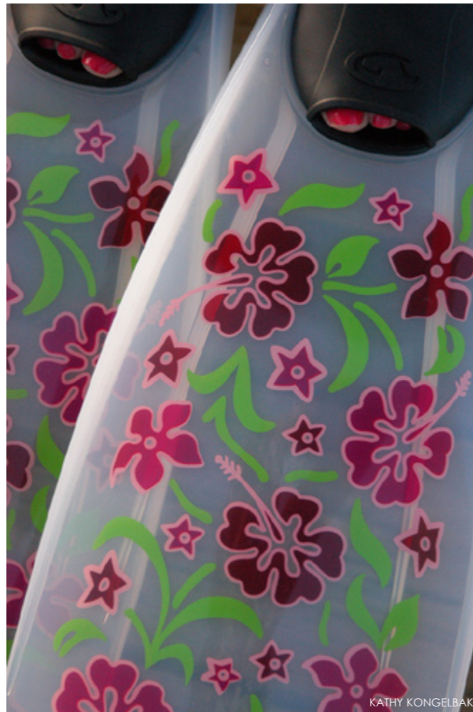
Funky Fins—fun fins with creative imagination

Coming into the pool, however, are women who want to make diving easier for other