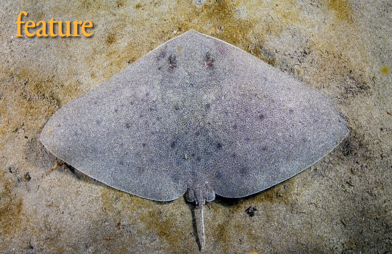
A rare encounter with a tiny juvenile Mazatlan butterfly ray

home about, it was well populated with guitarfishes, especially the southern banded kind, which were apparently not that rare after all, once we knew where to look.