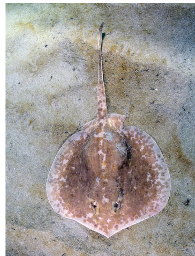
Chilean round stingray at El Jobo (above); Some Chilean round stingrays look uncannily like tortillas (top right)

Beyond the moorings, we came upon a shallow reef, rising out of the sand. Although the reef itself was nothing to write