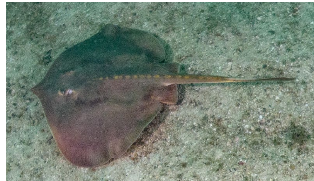
Pacific chupare stingrays are related to the freshwater stingrays of the Amazon (above); A juvenile Mazatlan butterfly ray near El Jobo (top center); A battle-scarred giant electric ray at Murch Mountain (top right); Proof of life—a rarely seen spinytail round stingray, Urotrygon aspidura , near Playa Del Coco (far right); Dark phase Chilean round stingray (right)

and then, perhaps responding to diminishing food supplies, a more recent ancestor changed course and moved back in the ocean. Adapt or die, it would seem.