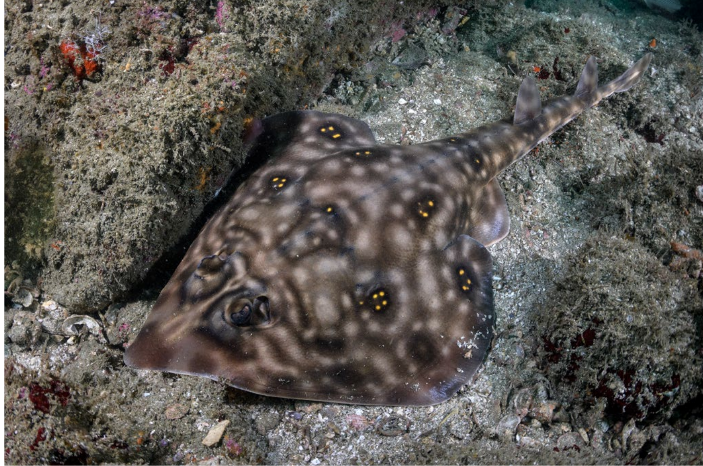
Longtail stingrays, Hypanus longus , are often quite skittish around divers (far left); Some Southern banded guitarfish have clusters of iridescent yellow spots (left); A Pacific spotted eagle ray at Sorpresa Reef (below)