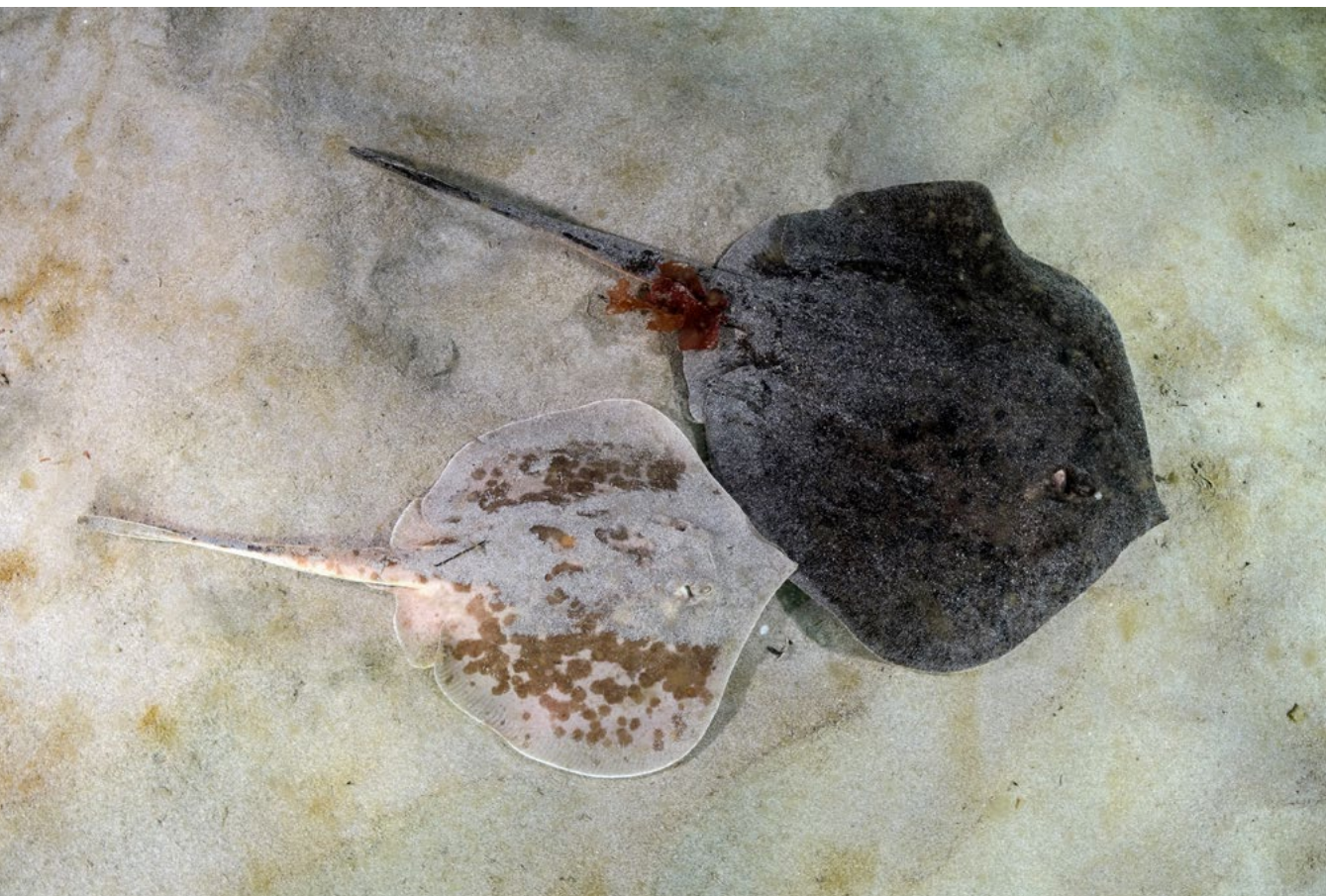
A male Chilean round stingray attempting to mate at El Jobo (above); A not-so-rare Southern banded guitarfish at El Jobo (top left); Pacific nurse sharks in The Nursery near Playa Del Coco (top right)