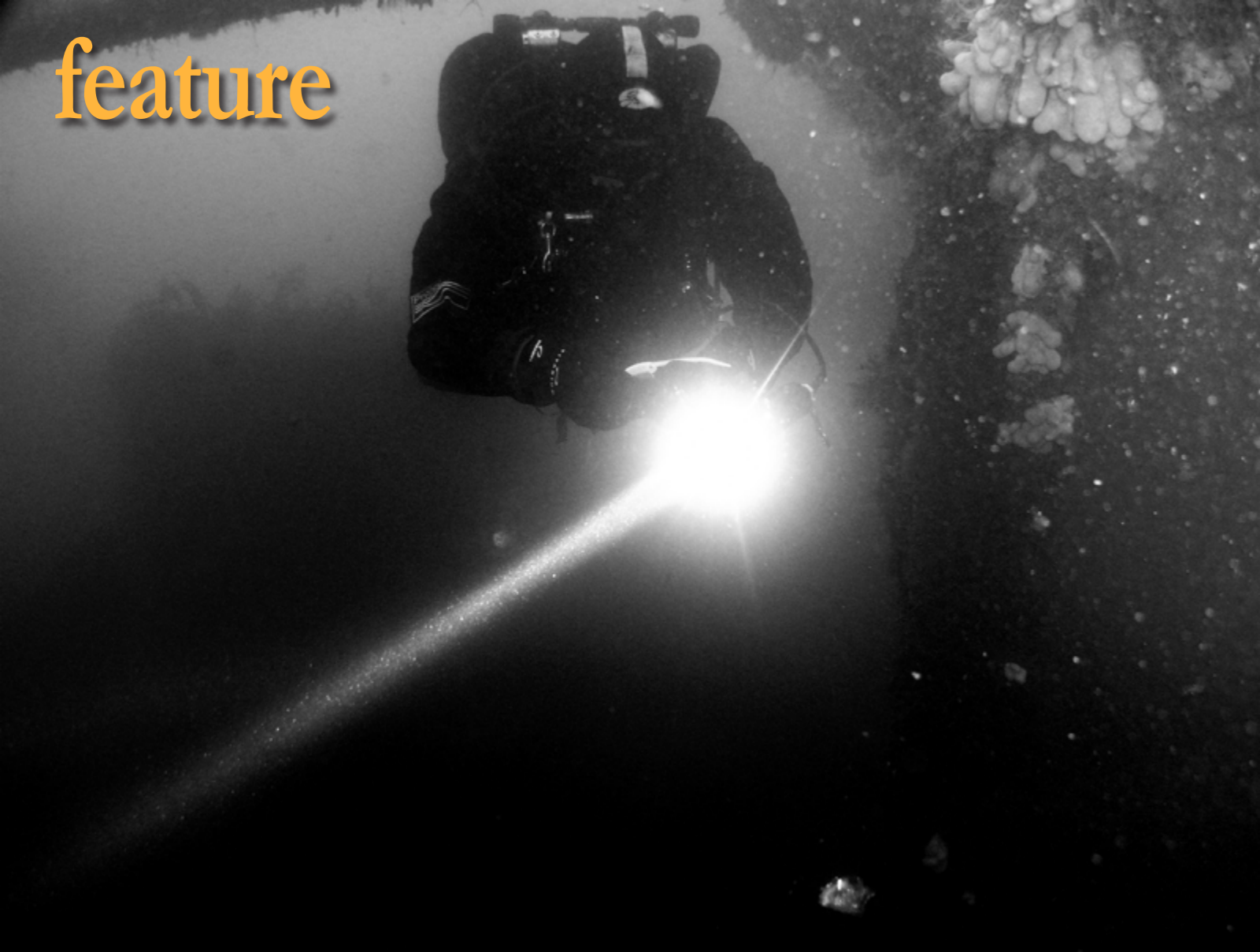
Technical diver taking notes in the deep

Obviously, this type of diving can only be undertaken with extensive training, experience and preparation. Divers should already have significant experience of recreational diving involving more than 100 dives before even considering technical diving. At this stage, they should find an experienced technical diving instructor who can give them the necessary training to move from recreational to technical diving.