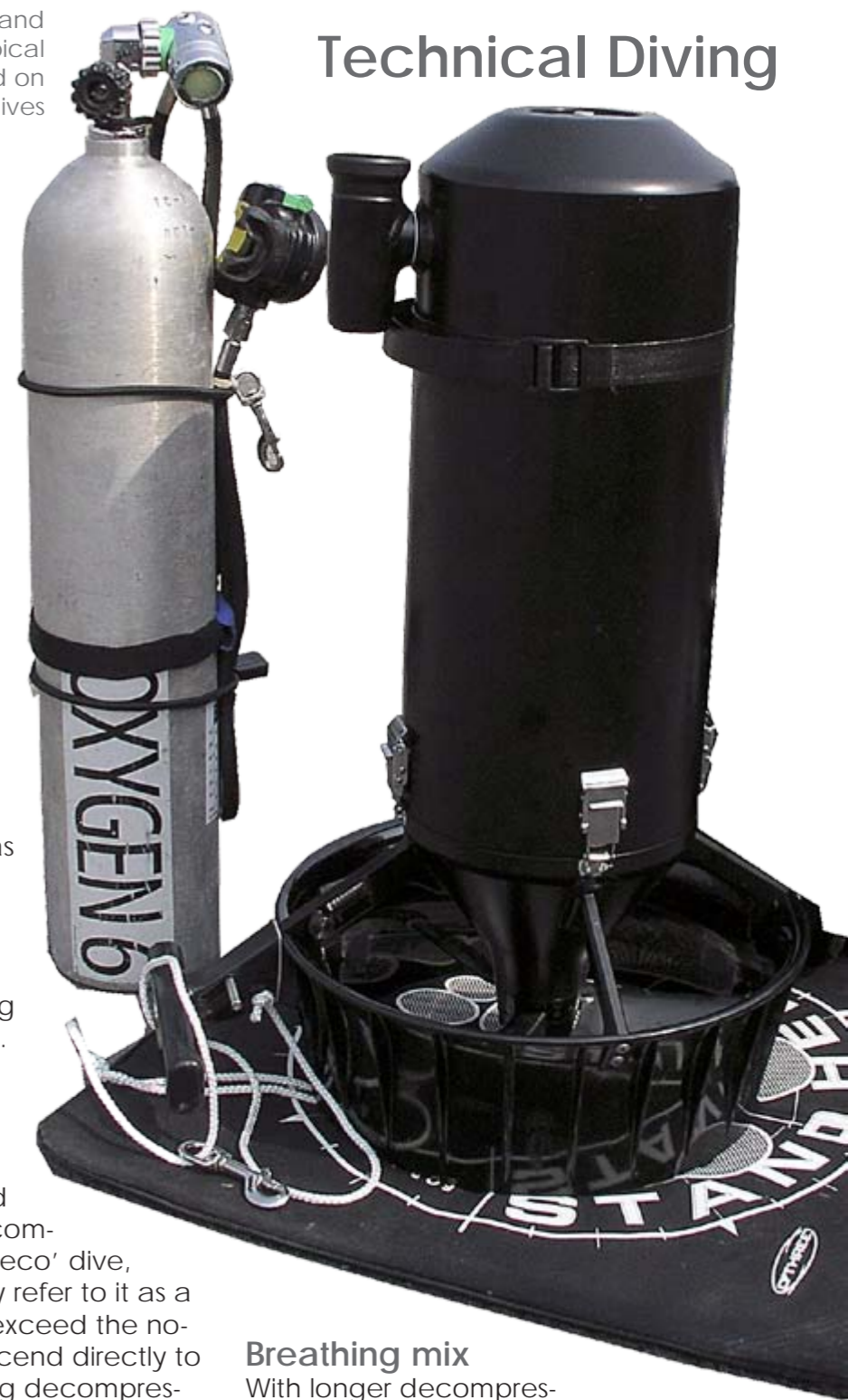
Oxygen tank and scooter are typical equipment used on technical dives