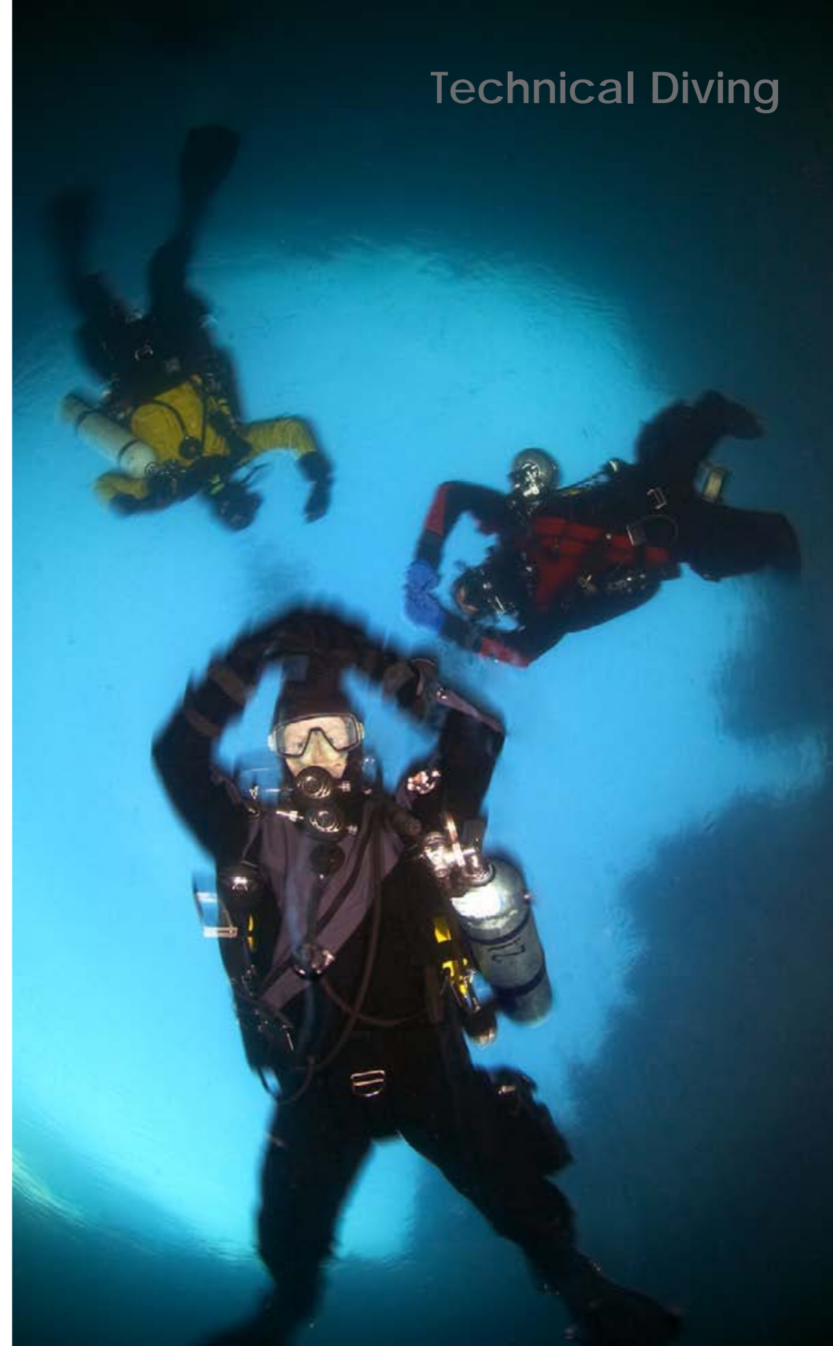
Divers form a small trident star around the ascent line as they begin their journey to the surface