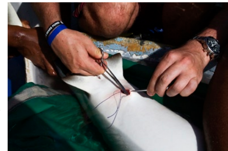
TOP TO BOTTOM: Preparing the tag and inserting the tag into the shark; Writing down all data (left)