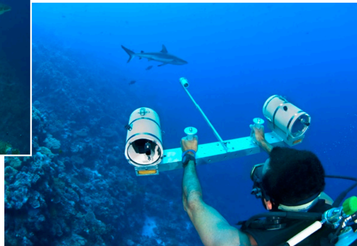
CLOCKWISE FROM TOP LEFT: Back onto the stretcher; Back into the water—some sharks are held by the tail until the researchers are convinced it is fully recovered; Accurate measuring of sharks free-swimming in the water by using new technology—a DOV (Diver-Operated Video) stereo camera system; Shark-watching in Palau