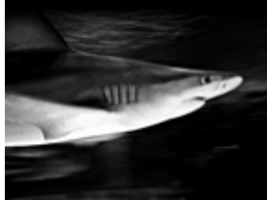
Grey reef shark