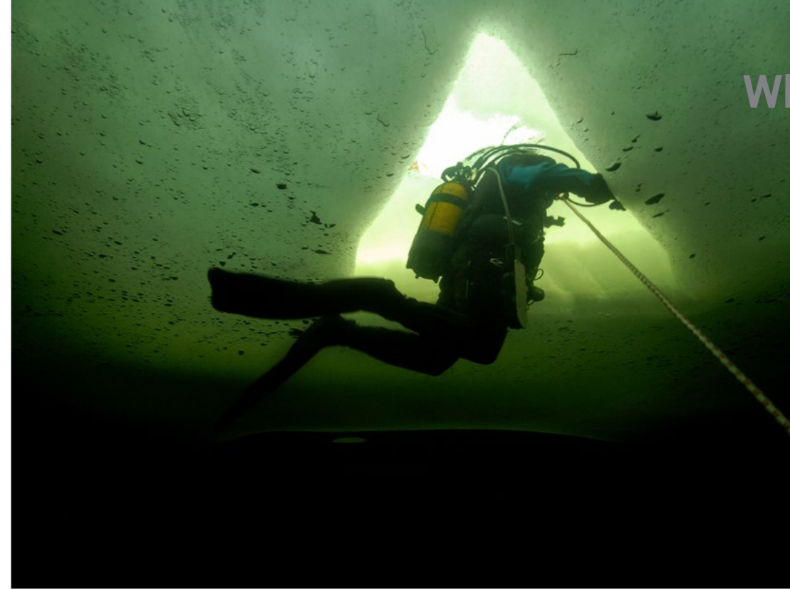
CLOCKWISE FROM FAR LEFT: Divers explore ice formations of Biofilter Bay; Divers enter and exit through the hole in the ice surface; Divers are secured to the surface using a system of ropes; Divers find clear, dark water beneath the ice