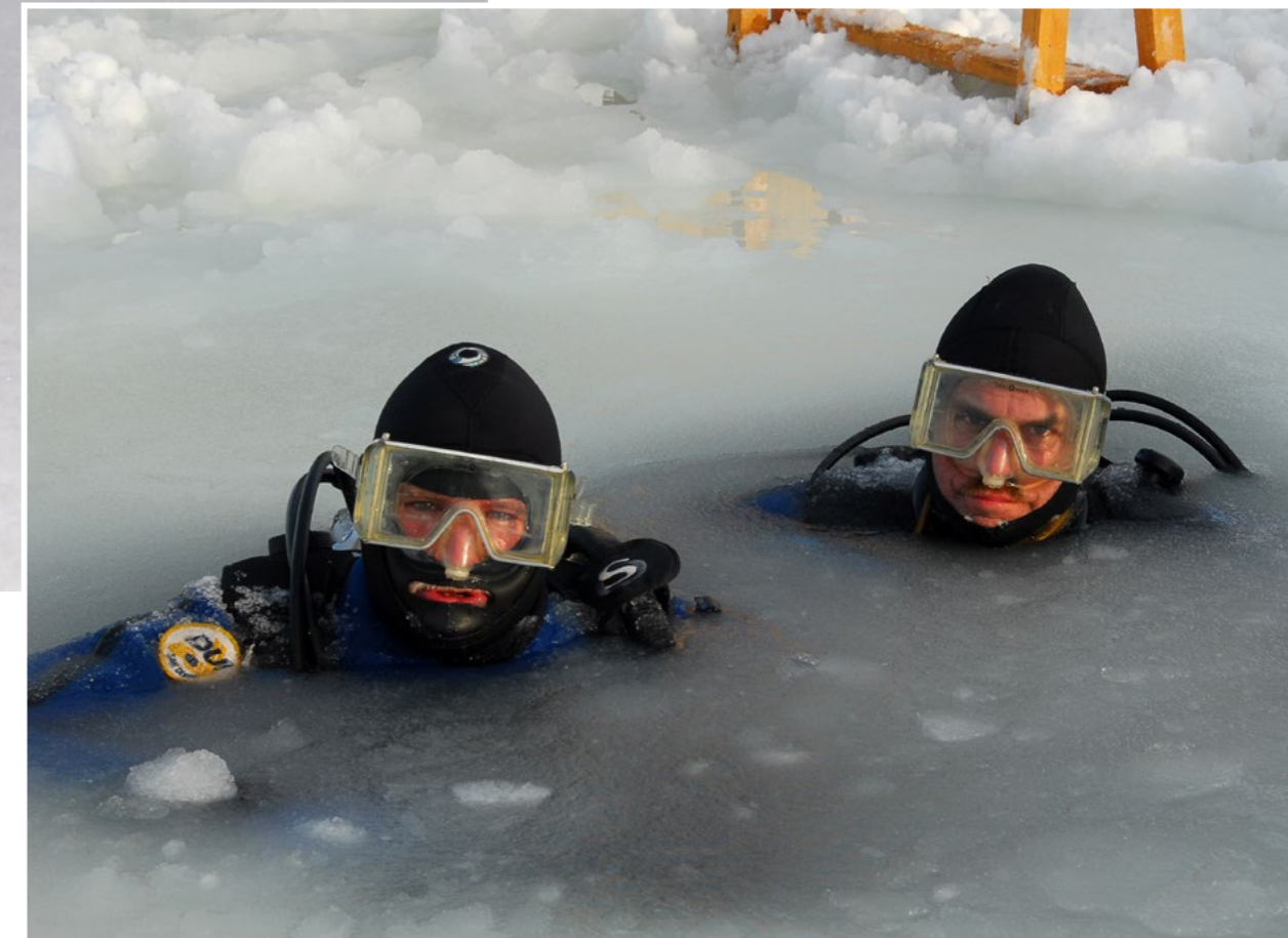
The authors entering the water

We gathered in the frigid pre-dawn hours, our gear and luggage piled in front of the snowmobiles and our noses freezing in the -22°F (-30°C) temperatures. It was time to be saying good bye to our Russian hosts after a week of diving the frozen White Sea but we were tempted to linger just a little bit longer. It was during these last few moments, as we stood under a curtain of stars on a deep, dark winter's night in Russia that we reflected back on the events of the past week.