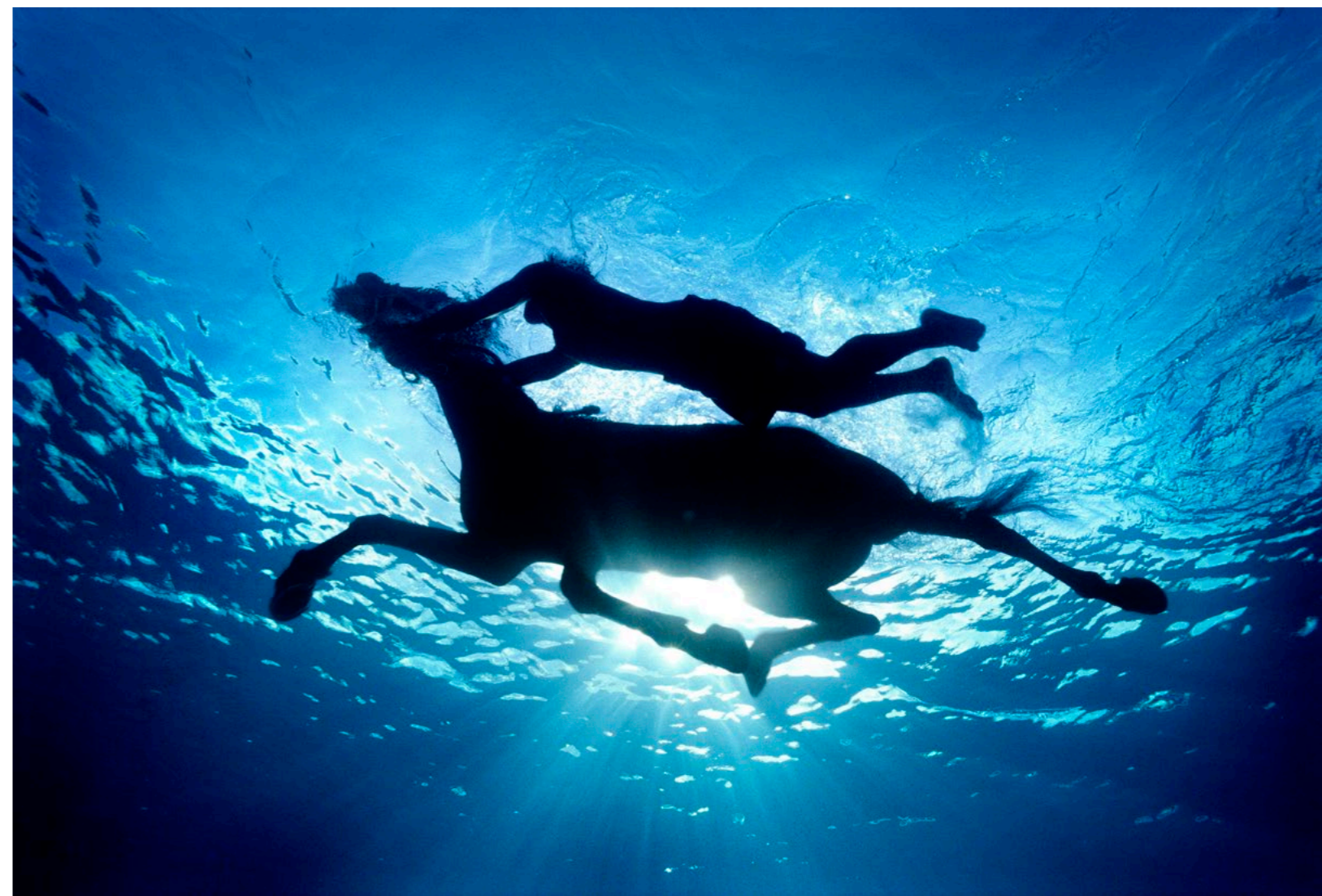
One of Holloway's best known images, captured in 1998, launched her career as a world-renown underwater photographer

However, passion is not enough. According to Holloway, a photographer needs to master the tech-