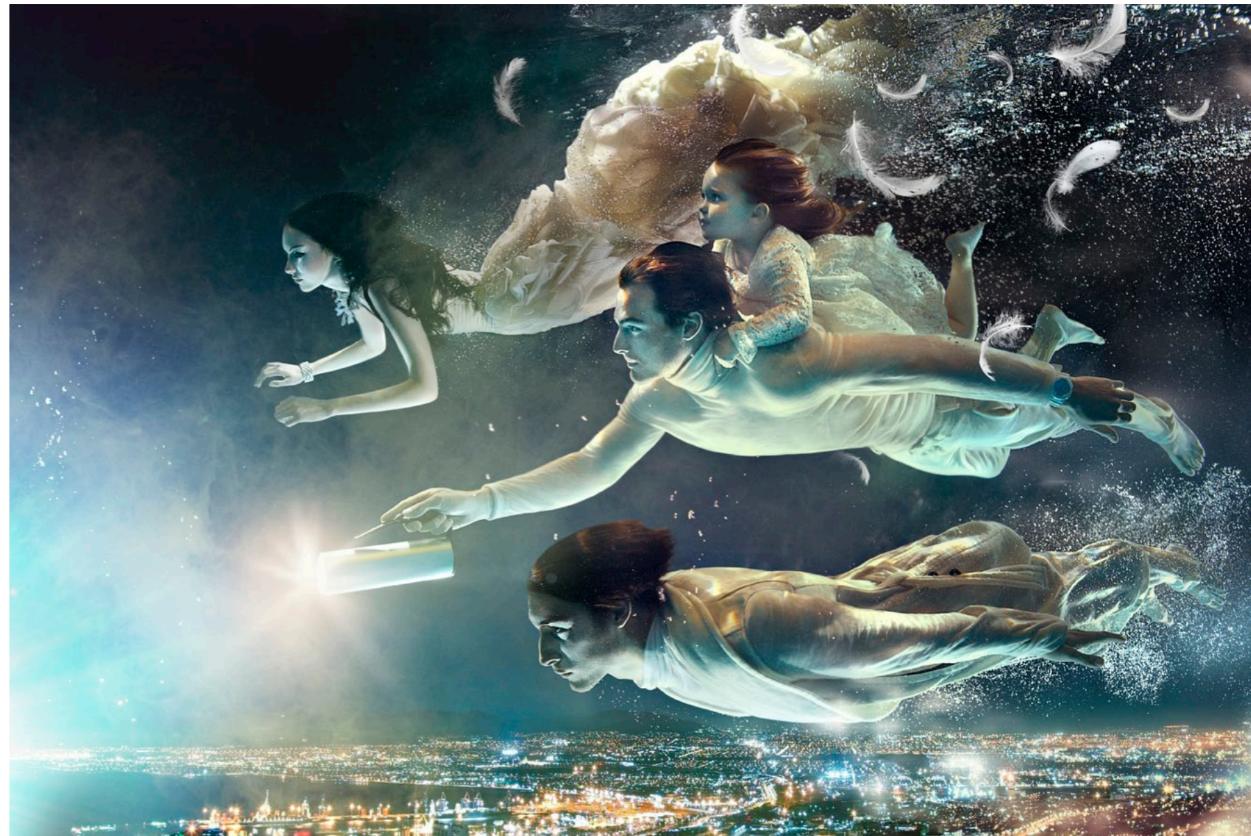
Holloway's final touch is often what makes her images pop, such as the addition of a little girl (above) at the last minute

Another important element in this shoot was the model's pose, said Holloway. In order to create a powerful composition, Holloway asked the girl to lay back in a sleep-like state, a pose that does not come naturally for most people underwater. Holloway guided the model to the pose she had envisioned in her mind. After several attempts, with the model using a nose-clip, Holloway got the shot.