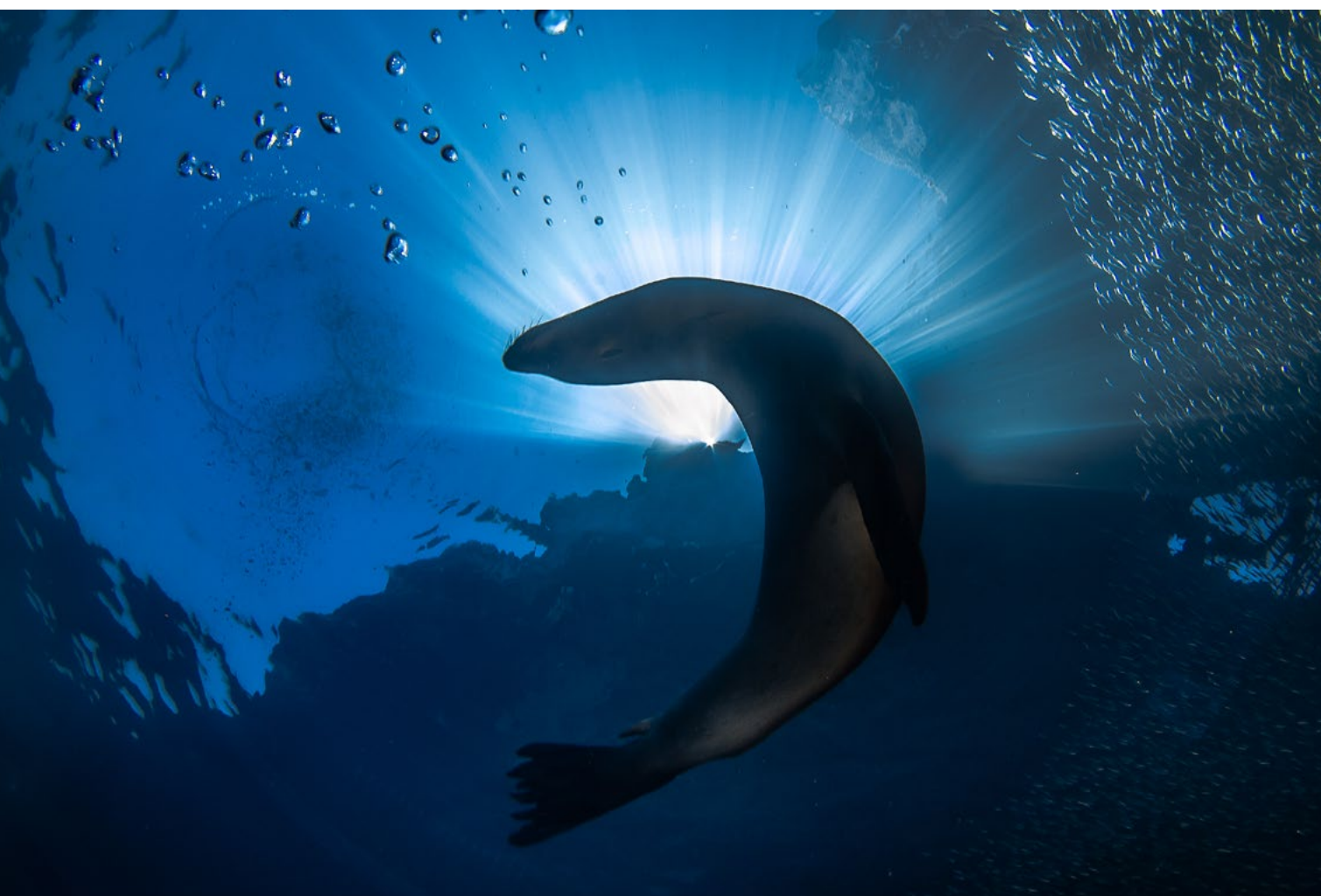
Agility, speed and somersaults—sea lions move like acrobats underwater (left); Rocks of Los Islotes (top left); Sea lions and sea birds at sunset over the Sea of Cortez.

and the risk is even more critical during periods of reproduction, when adult males are very territorial and aggressive.