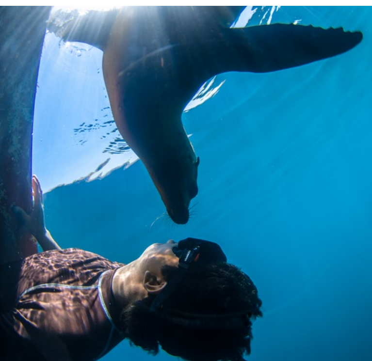
LEFT TO RIGHT: Very friendly sea lion, maybe too friendly; Freediving is a good way to interact with sea lions; Fins are one of the favourite chew toys of the sea lions; Young sea lion playing with a porcupinefish like a toy

played with the elasticity of our neoprene suits or softly chewed the tips of our fingers.