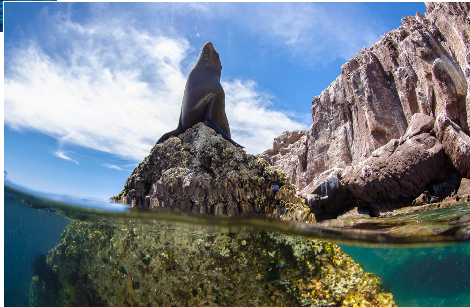
When they are not underwater, sea lions sun themselves to dry, thermoregulating their bodies; Coral reef of Los Islotes (top)

Once in the turquoise water, a quick round of observation was required to get oriented. Very curious and mischievous, the young sea lions were like puppies. They started swimming around us. Then they quickly became friendly to us divers and showed a keen interest in our equipment. Once confident, they nibbled our palms, tried to grab the straps of our masks,