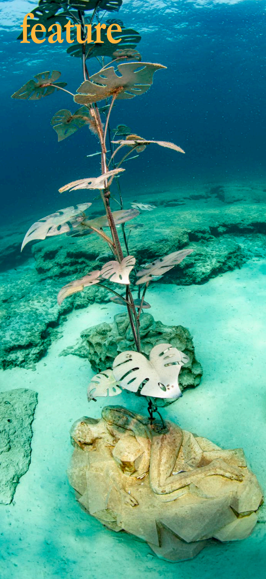
The MUSAN dive site is just a ten-minute boat ride from port.