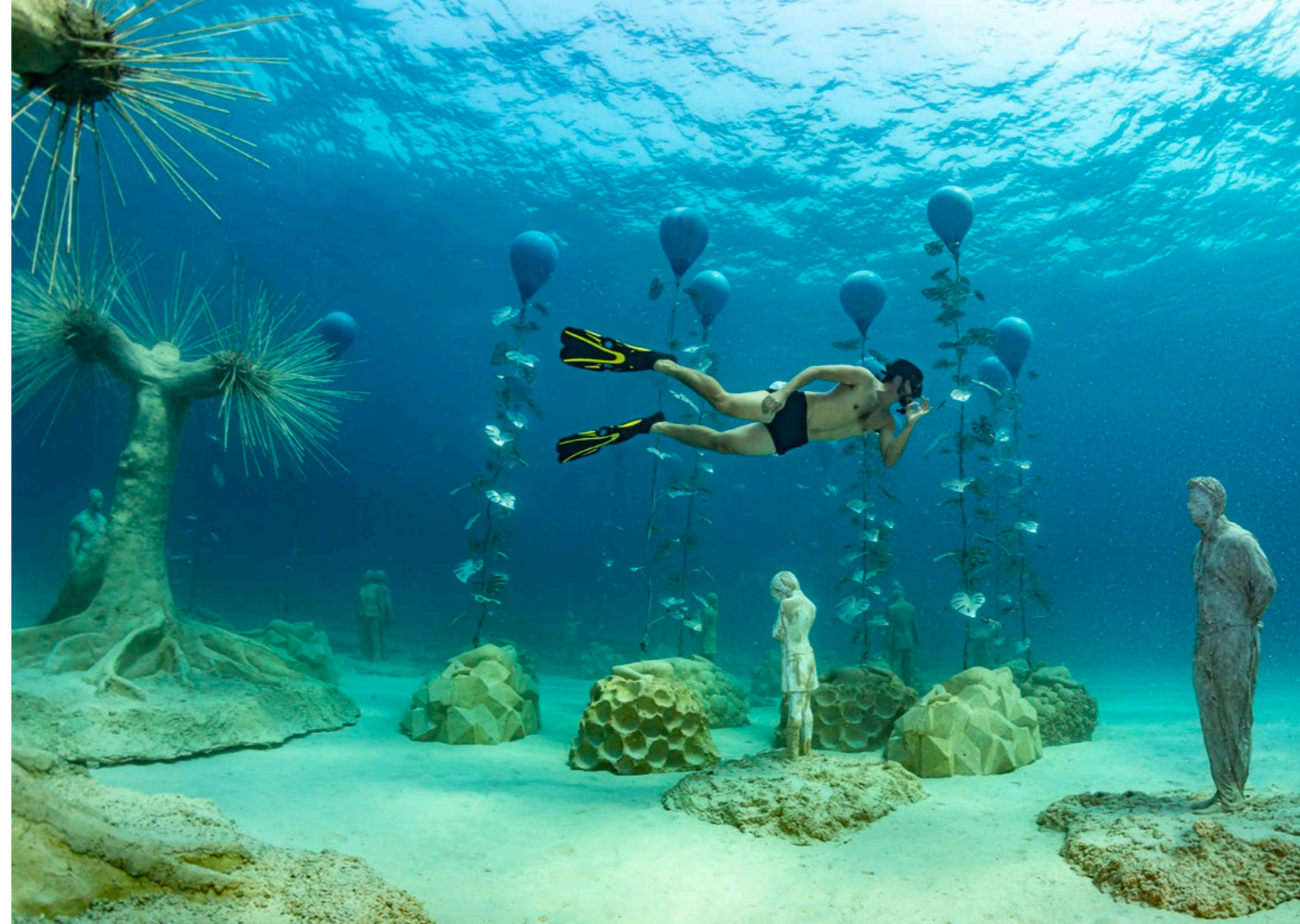
The museum is accessible to nearly all underwater enthusiasts, including snorkelers and divers of all levels of experience.

museum, whose water boundaries were marked with stationary buoys. After a short briefing, we got into the water. Visibility was about 20m, and the water temperature was a balmy +29°C. We swam close to the buoys, where the outlines of this grand “miracle” underwater were already visible from the surface.