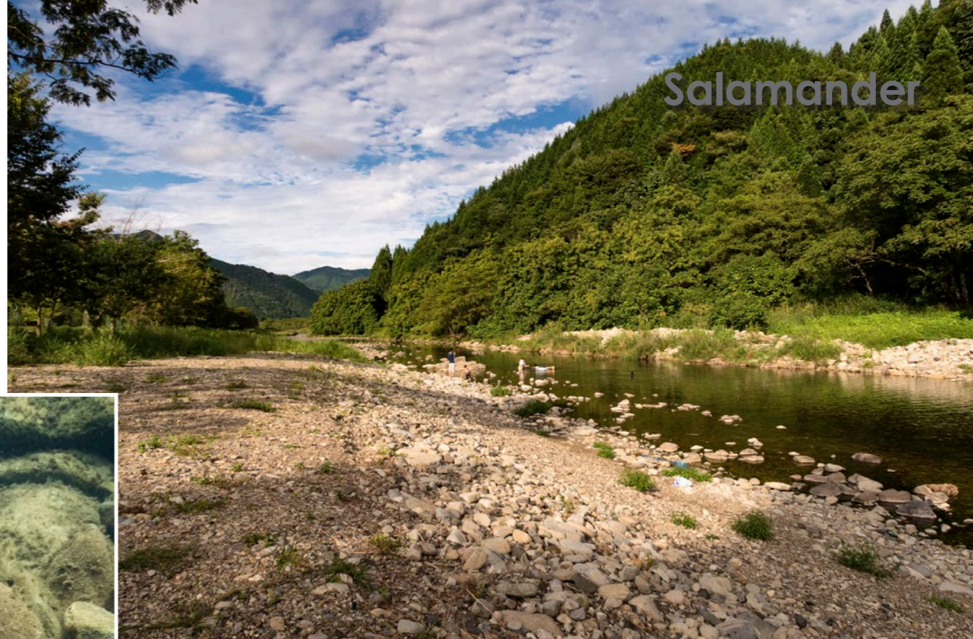
The local river near Wara Village in Gifu Province (right)